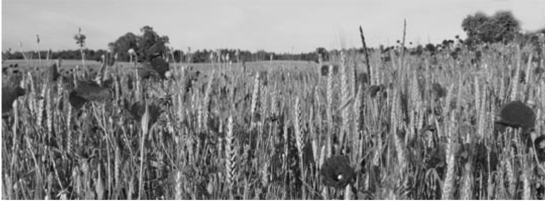
Field of colorful wildflowers displaying their bright red and blue colors.

will see today, but have you ever wondered how we see these colors? What about other animals, do they see the same colors as you? Do animals see color at all?