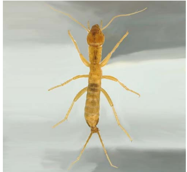
Figure 3. Galloisiana nipponensis , an extant member of the Notoptera in northern Japan.

Galloisiana nipponensis (Figure 3) was first described by Caudell and King in 1924 from Japan. This was the introduction of a new genus and new family, the Grylloblattidae . This species occurs on the ground under stones and in moss (Memim Encyclopedia 2015). To date, no eggs have been found among mosses in G. nipponensis (Rentz & Ingrisch 2009).