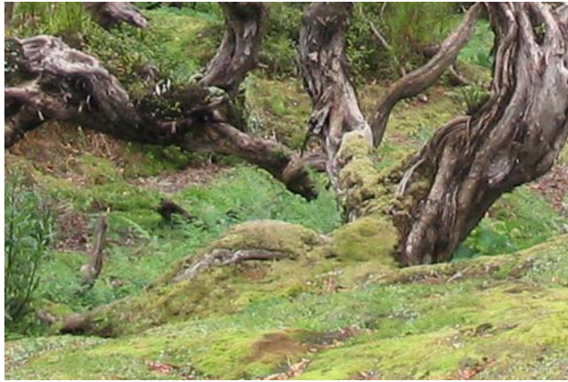
Figure 6. Metrosideros umbellata (rata) showing horizontal trunks with mosses where one might find Echmepteryx madagascariensis .

Evidence of members of Psocoptera eating bryophytes is limited. Valle et al. (1977) reported one that feeds on mosses and lichens growing on citrus in Cuba.