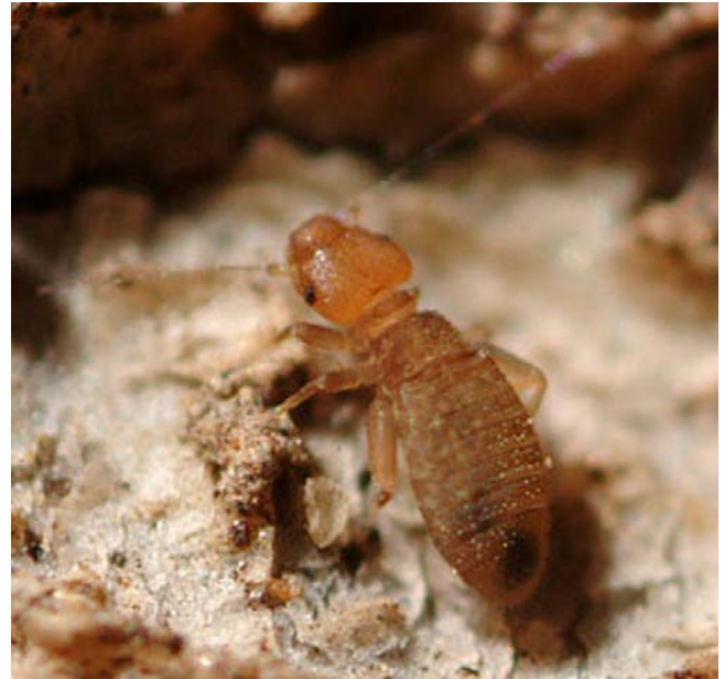
Figure 8. Liposcelis sp. hiding under bark.

Some members of this order are known from mossy forests, but the role of the mosses is unclear. García Aldrete (2009) reported several species from this habitat in Argentina: Polypsocus jujuyensis , Polypsocus selenius ( Amphisocidae ), Lachesilla dividiproctus , Lachesilla peckorum , and Lachesilla cuala ( Lachesillidae ). On the other hand, Thornton (1985) found that the numbers and diversity of Psocoptera decreased on mountain tops with wet conditions and epiphytic mosses in many areas of the Pacific.