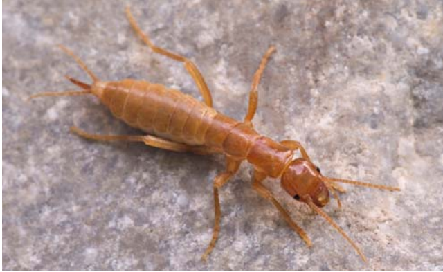
Figure 4. Grylloblatta campodeiformis , a cold climate species that lays eggs on mosses.

be that arachidonic acid, a polyunsaturated fatty acid in mosses, might contribute to this cold tolerance? Nevertheless, it migrates downward to overwinter among the rocks under deep snow where it is assured of temperatures above its -6.5^{\circ}\text{C} lethal temperature (Edwards 1987). Henson (1957) was able to maintain nymphs of Grylloblatta campodeiformis (Figure 4) at 4.5^{\circ}\text{C} for six months.