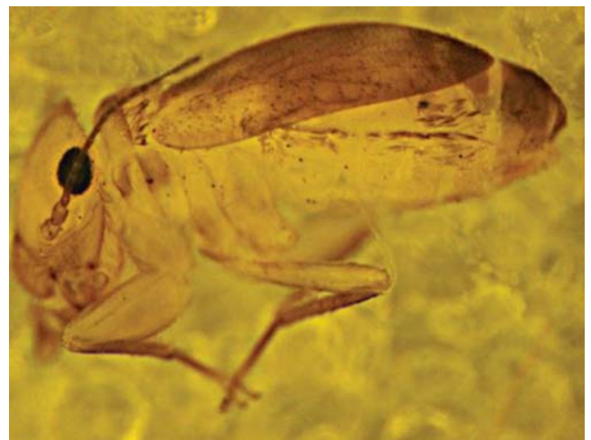
Figure 9. Cyptophania pakaratii , a species apparently restricted to the fern-moss patches in cave entrances.

Some Psocoptera are restricted to caves. The neotenous (retaining juvenile characteristics in adults) Cyptophania pakaratii (Figure 9) seems to be limited to the fern-moss "gardens" in the cave entrances (Figure 10) in the Pacific basin (Mockford & Wynne 2013). These habitats serve as relict habitats of the last glacial maximum, supporting species that are restricted to the conditions they offer (Benedict 1979; Northup & Welbourn 1997; Wynne 2013; Wynne et al. 2014).