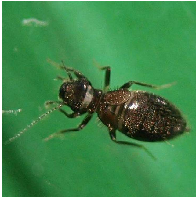
Figure 7. Lepinotus patruelis , a moss dweller on logs and trees in Tasmania.

Schmidt and New (2008) recorded other Psocoptera in association with mosses in Tasmania. Lepinotus patruelis ( Trogiidae ; Figure 7) was among mosses on a log; Liposcelis ( Liposcelidae ; Figure 8) occurs among mosses on logs and living trees.