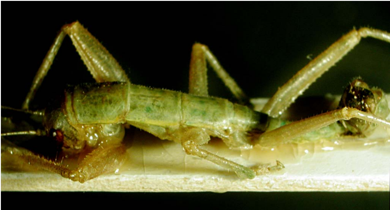
Figure 1. Example of Mantophasmatodea , a subgroup of the Notoptera .