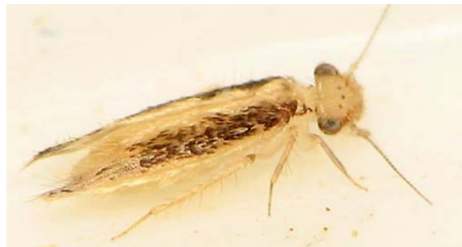
Figure 5. Echmepteryx madagascariensis , a species that lives among mosses on horizontal trunks of Metrosideros .

Bryopsocus ( Bryopsocidae ) is associated with trees and mosses in wet forests (New & Lienhard 2007). This genus is endemic to New Zealand. Only two species occur there, both associated with mosses: Bryopsocus angulatus and B. townsendi , ranging 2-3 mm long (Bess & Johnson 2009). Likewise in New Zealand, Echmepteryx madagascariensis ( Lepidopsocidae ; Figure 5) lives on mosses that grow on the horizontal trunks of Metrosideros (Figure 6) (Smithers 1973). Smithers (1974) also collected Spilopsocus aviis ( Elipsocidae ) from mosses in the subAntarctic islands of New Zealand.