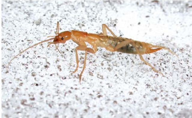
Figure 2. Member of Grylloblattidae on snow, a small family that may lay eggs in mosses.

The Grylloblattodea are predominately nocturnal and feed on detritus (Wikipedia 2015). They are wingless and have either reduced eyes or no eyes (Figure 2). There is only one family and it is comprised of only 5 genera and 34 species that live mostly in leaf litter and under stones of extremely cold environments of higher elevations.