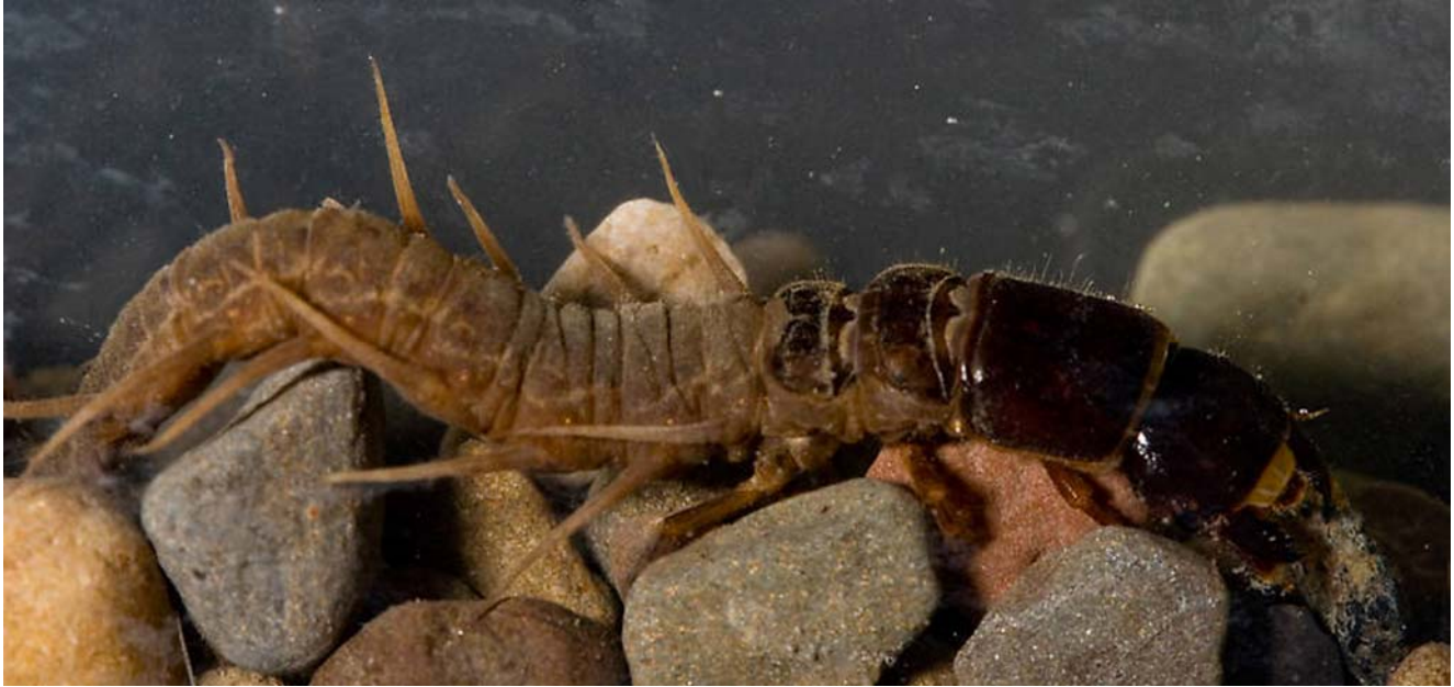
Figure 1. Nigronia serricornis larva (Megaloptera), a species that sometimes pupates in mosses.