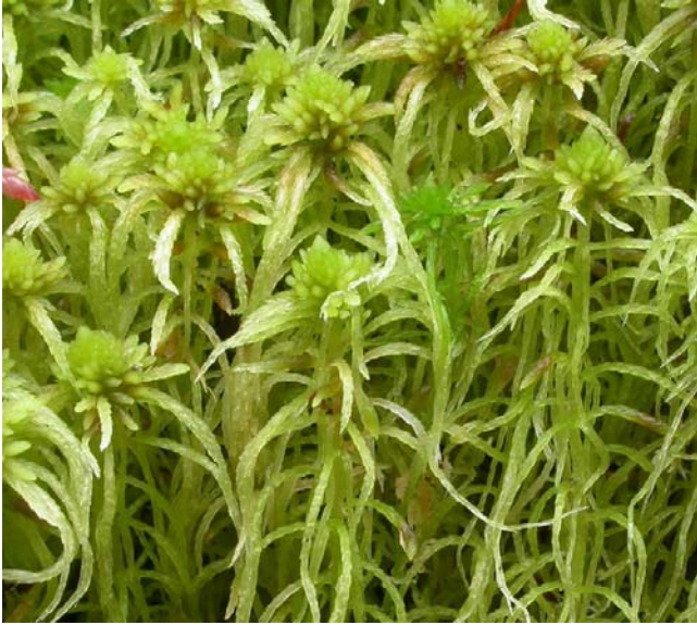
Figure 18. Sphagnum fimbriatum , a genus that lives in Africa and is a potential home for pupae of Sialidae .