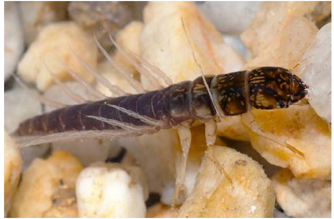
Figure 15. Sialis lutaria larva, the aquatic stage that migrates into the water, sometimes from streamside bryophytes.