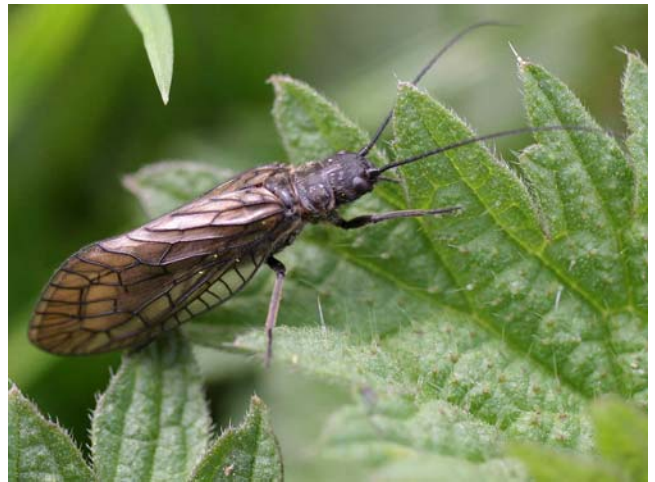
Figure 16. Sialis lutaria adult.