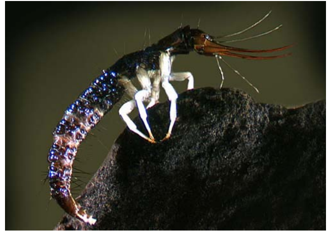
Figure 6. Kempynus sp larva, member of the small family Osmylidae that inhabits mosses near streams.

Like Osmylus fulvicephalus (Figure 2-Figure 5), Kempynus sp. (Figure 6) in the Southern Alps of New Zealand is somewhat amphibious, living at the edge between water and land (Cowie & Winterbourn 1979). In springbrooks it lives in clumps of the mosses Acrophyllum quadrifarium (= Pterygophyllum quadrifarium ; Figure 7) and Cratoneuropsis relaxa (Figure 8).