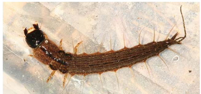
Figure 23. Chauliodes rastricornis larva, a species that may move to mosses to pupate.