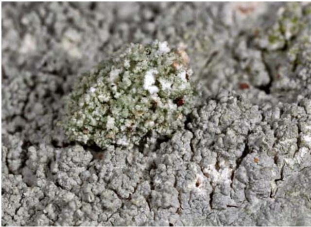
Figure 9. Leucochrysa pavidata larva with lichen back pack, showing its camouflage against tree bark lichens.

There are a number of reports of the larvae of the green lacewing Leucochrysa pavidata (Figure 9-Figure 12) using bits of lichen as camouflage (Tauber et al. 2009; Moskowitz & Golden 2012). In fact, Wilson and Methven (1997) found that the larvae at their Illinois, USA, site were somewhat specific in the species of lichens they chose. But Slocum and Lawrey (1976) found that this insect was not totally specific. In addition to the lichens, it also includes pieces of bark, angiosperm pollen, fungal spores, insect debris, and (of course) bryophyte gametophytes. Slocum and Lawrey demonstrated that the lichens, at least, are still alive and that they have photosynthetic rates equal or greater than those same lichen species still growing on a bark substrate. Furthermore, these lichen propagules are still viable when the cocoons are attached to the bark, giving the lichens the opportunity and establish in this new location. Unfortunately, there are no similar studies on the bryophytes in this camouflage arrangement, but it at least provides the possibility for a means of dispersal.