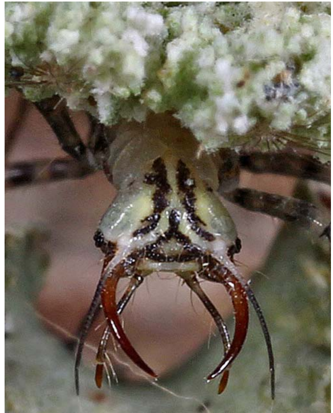
Figure 12. Leucochrysa pavidata larva showing head and large mandibles of this carnivore.