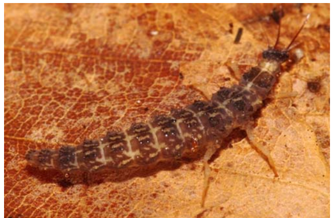
Figure 2. Osmylus fulvicephalus larva, a species that lives among mosses on streambanks and feeds there.

mosses (Elliott et al. 1996) near water, laying about 30 eggs either singly or in pairs. Larvae leave the egg site within 1-3 days to burrow into mosses. Larvae may live in or out of water, but pupation is on land, lasting 7-18 days. If the larvae are submersed, they crawl out of the water (Ward 1965). If the moss is submersed, they burrow deeply into it, but within 8-28 days of submersion they die. Adults live two weeks to three months, depending on species and location.