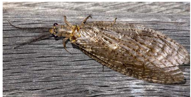
Figure 22. Chauliodes pectinicornis adult, a species that lives in the water as larvae and pupates among mosses.