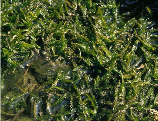
Figure 19. Fontinalis antipyretica , home to numerous kinds of insects and useful for comparing heavy metal accumulation.