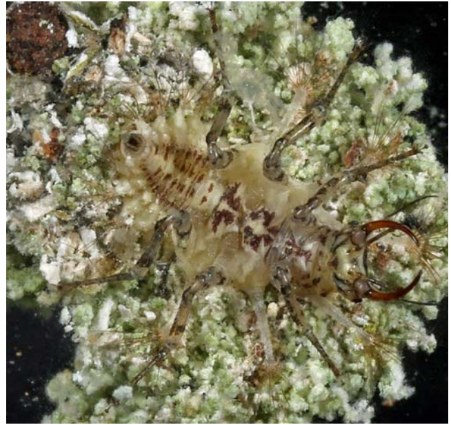
Figure 11. Leucochrysa pavidata larva showing ventral side.