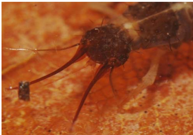
Figure 5. Osmylus fulvicephalus larva showing large jaws.

Osmylus fulvicephalus (Figure 3) is controversial in that its larvae live in wet mosses, but drown in 8-28 days of submersion (Elliott et al. 1996). Nevertheless, they do enter the water in search of food. It seems safe to say, however, that their relationship with mosses is damp, but not aquatic. The larva feeds among these mosses. When movement is detected, it jabs at it with the long proboscis, then injects it with a salivary secretion that paralyzes it. A chironomid larva is paralyzed within 10 seconds. The O. fulvicephalus then sucks out the interior of the prey. The larvae stop eating during mid autumn and burrow down to the moss rhizoids to hibernate for the winter. Fortunately, in this state they can survive occasional submersion in water, thus surviving spates (sudden flood in a river, especially one caused by heavy rains or melting snow). In spring they spin a silken cocoon, sometimes incorporating bits of moss in the cocoon. Just before pupation the long jaws break off (Figure 5). The pupa becomes immobile during pupation. It grows a pair of mandibles that it uses to cut its way out of the cocoon.