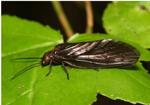
Figure 14. Sialis adult, a genus that sometimes pupates and lays eggs among streamside bryophytes.

I have only found reference to one genus of bryophyte dwellers, Sialis (Figure 13-Figure 17) (Lithner et al. 1995). I likewise found this genus occasionally among bryophytes in Appalachian Mountain, USA, streams (Glime 1968). It has aquatic larvae, but adults are terrestrial and lay eggs near water (Alderfly 2014). Fully grown larvae of Sialis pupate in soil, mosses, under stones, and other locations, usually near water. In Canada, after about one month the adults appear. Sialis nigripes prefers mosses for egg laying (Elliott et al. 1996). Sialis lutaria (Figure 15-Figure 17) was used in a study comparing heavy metal accumulation in mosses ( Fontinalis spp.; Error! Reference source not found. ), insects, and fish (Lithner et al. 1995).