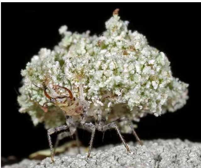
Figure 10. Leucochrysa pavidata larva with lichen back pack, showing the legs and mandibles of the larva.