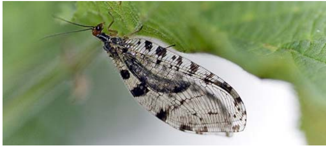
Figure 3. Osmylus fulvicephalus adult that lays its eggs on overhanging vegetation. Larvae live among streambank mosses.