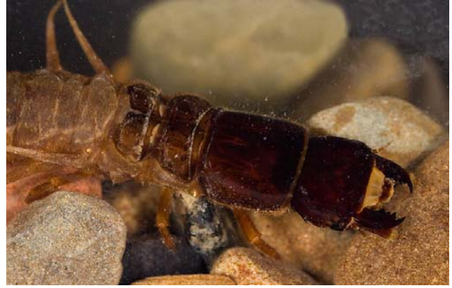
Figure 20. Nigronia serricornis larva showing powerful jaws. The aquatic larva often crawls into mosses to pupate.

Nigronia , an aquatic member of the Corydalidae , is not typically a moss inhabitant, although I did occasionally find larvae of this genus among Appalachian Mountain stream bryophytes (Glime 1968). But like many other aquatic insects, Nigronia serricornis (Figure 20-Figure 21) pupates among mosses as well as under stones and logs (Needham et al. 1901). Likewise, Chauliodes pectinicornis (Figure 22) and C. rastricornis (Figure 24-Figure 24) pupate in these habitats. Pupation lasts about 2 weeks in these Corydalidae .