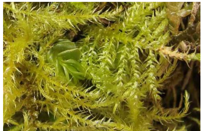
Figure 8. Cratoneuropsis relaxa , a moss habitat for Kempynus sp. at stream borders and in springbrooks in New Zealand.