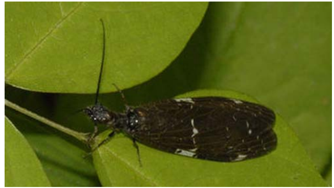
Figure 21. Nigronia serricornis adult. Pupae of this insect often reside in mosses.