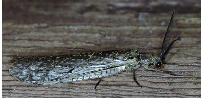
Figure 24. Chauliodes rastricornis adult, a species that lives in the water as larvae and pupates among mosses.