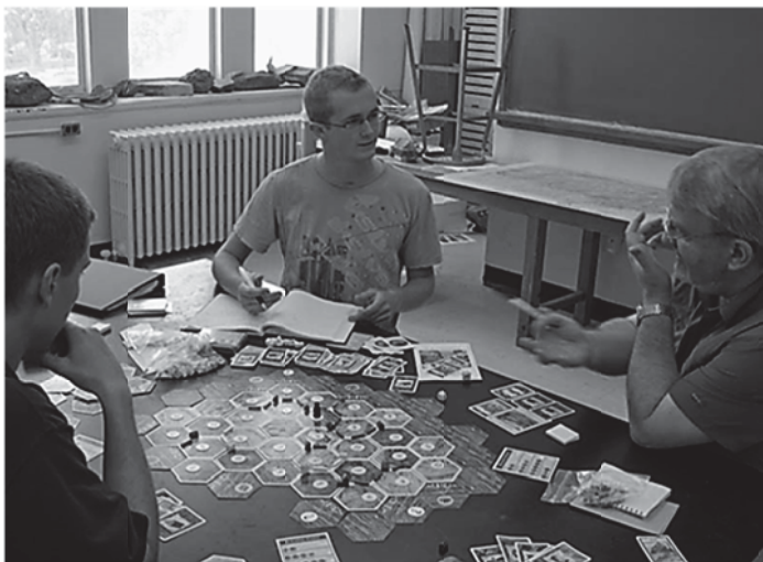
Fig. 1. Scenario development using a frame game design approach

Following the framing exercises, the group met in break-out groups to design three independent games, all set in an urban space - the area around a typical school or campus - but still board-based. Variants that were proposed included a mystery game with the participants as investigators, and two variations on a game of capturing buildings to control the overall 'field.' The resulting ideas were discussed, and the exercise was re-run, this time assuming game play would be mobile and would use devices such as smart phones, and perhaps could integrate augmented reality elements.