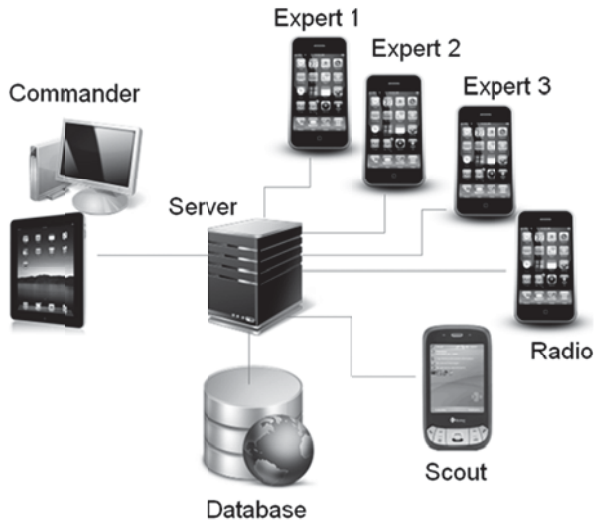
Fig. 5. Architecture of Energy Wars Mobile prototype.