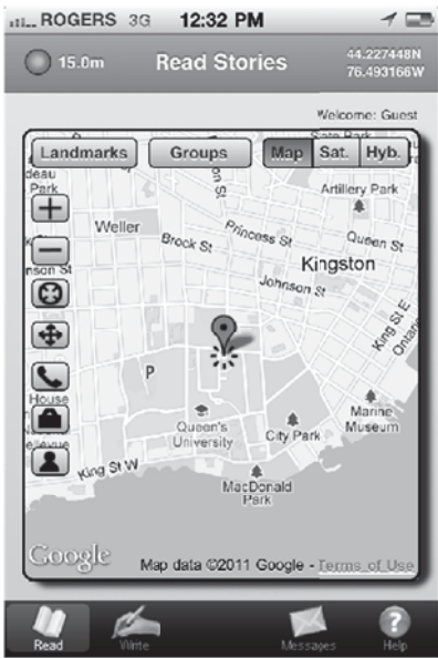
Fig. 7. A Landmark in Situated on an iPhone. The new Landmark supports storytelling, photo documentation, and ultimately game creation.

administrators and content creators, and has geographic locales supporting the idea that regions may have different communities of interest who wish to document their environment. Ultimately Situated has a strong relationship with the idea of hotspots in Energy Wars Mobile : in a future game scenario those hotspots might be anything that a community in Situated wished to document, meaning that Situated communities could transition to game communities.