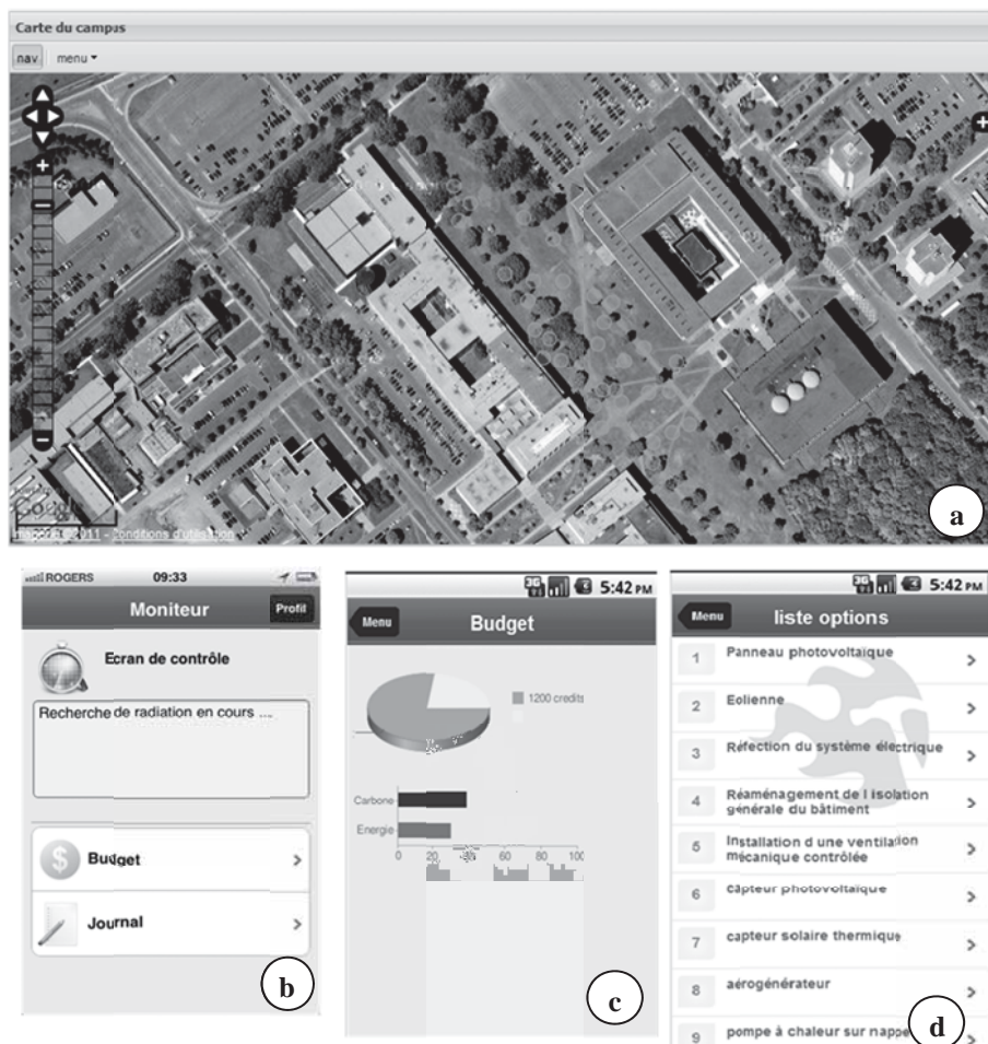
Fig. 3. Energy Wars Mobile displays and information: a) game map with geotag database (display in yellow); b) main screen control of the expert app; c) information about the player budget and building sustainability gauges; d) list of available technologies to upgrade for buildings.