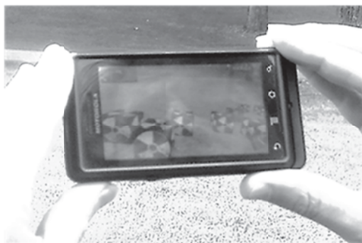
Fig. 4. Energy Wars Mobile prototype: visualisation of the virtual radiation markers using augmented reality markup.

Developing the underlying architecture of Energy Wars Mobile exploited researchers – nodes in the immediate network – that until this point had had relatively little input, given that their expertise was not in design but in mobile solutions development and deployment. Energy Wars Mobile relies on a client-server architecture (Figure 5) built using the PhoneGap open source framework ( http://www.phonegap.com ), which allows rapid cross-platform development and provides support for both mobile and desktop platforms. This allows, for example, the Commander persona to deploy either on a desktop or on a tablet computer depending on the teacher's specific needs. The underlying content is stored in a PostgreSQL database and conveyed through an Apache Tomcat server. The Expert and Radio personas are deployed on iPhones currently, and the Scout (which ultimately is to employ Augmented Reality ideas) is implemented on Sony Ericsson Xperia with Android.