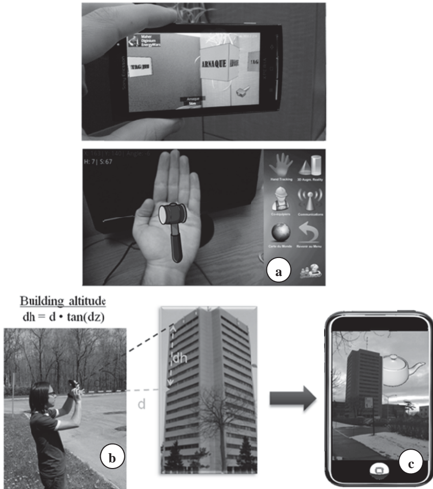
Fig. 6. Mobile Augmented Reality applications used in Energy Wars Mobile prototype: a) Mobile AR apps using geographic location; b); AR apps to augment gamer hand with virtual tools; c) iModelAR apps involving fast and easy 3d modeling of buildings.