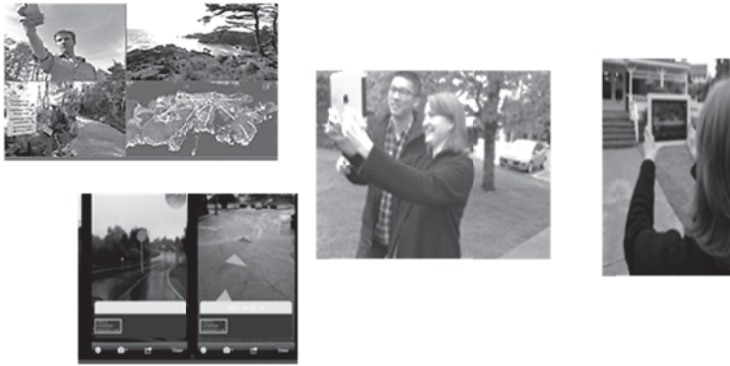
Fig. 9. (L-R) VAPoR field testing; SMARTEE field testing; collaboration in real community