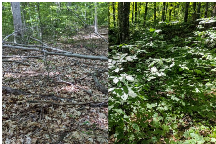
Figure 3. Sites within the same region with differing regeneration responses. Left, a site with above ground F. grandifolia mortality but no suckering response in the understory. Right, a site with above ground F. grandifolia mortality and an early thickening response. Planting of trees would be possible with little control in the site with no suckering response, but intense silvicultural treatments would be necessary to plant in the site with a F. grandifolia thicket response.

may not be necessary if natural gaps due to BBD mortality can be utilized as planting sites. Research is necessary to quantify the amount of cover that would best support Fagus seedling growth in interplantings, and methods for the planting of larger seedlings or sowing of seeds in natural, degraded systems.