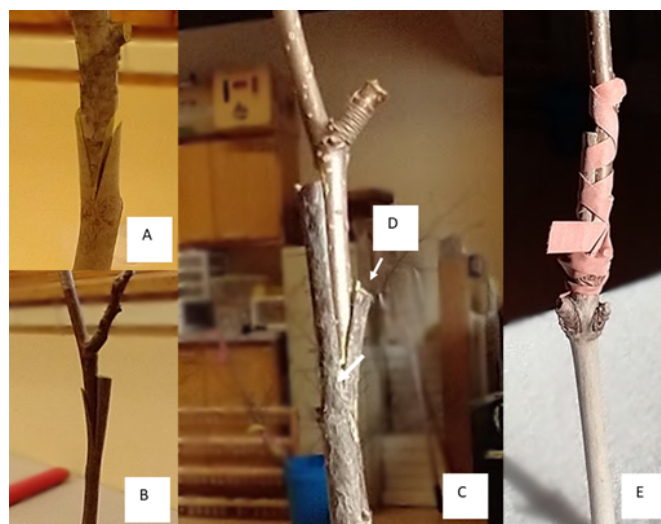
Figure 1. Grafts acceptable for use in F. grandifolia . (A) Top Cleft graft, performed with a FieldCraft Top Grafting. (B) Apical veneer graft. Two veneer grafts may be staggered on opposite sides of the rootstock. (C) Modified side graft with (D) enhanced sap drawer. (E) A graft union wrapped with space sufficient to allow callus formation.

In all grafting, tools, scions, and rootstocks should be disinfected with a 70–80% ethanol solution to prevent contamination. After cutting, the cambium of the rootstock and scion should be laid fully flush together, matched exactly on at least one side of the cut surface. If an exact match is not possible, a larger scion should be selected and matched on one side [69]. Grafts should be gently, yet firmly secured with flexible materials such as grafting rubbers. Rubbers should be wrapped with space sufficient for callus expansion (Figure 1). The entire tree should be dipped in warm (55 °C) paraffin wax past the graft union to prevent drying.