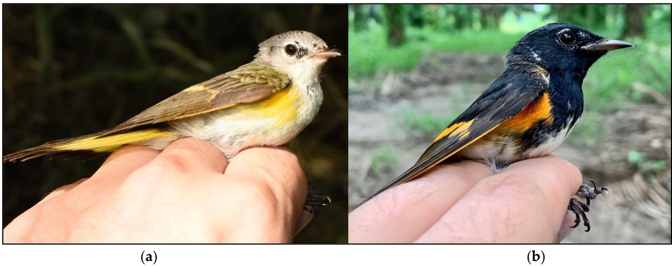
Figure 2. Pictures of the first year male American Redstart (SR6) captures in the first (a) and the second (b) wintering season, in oil palm plantations, Tabasco, Mexico.