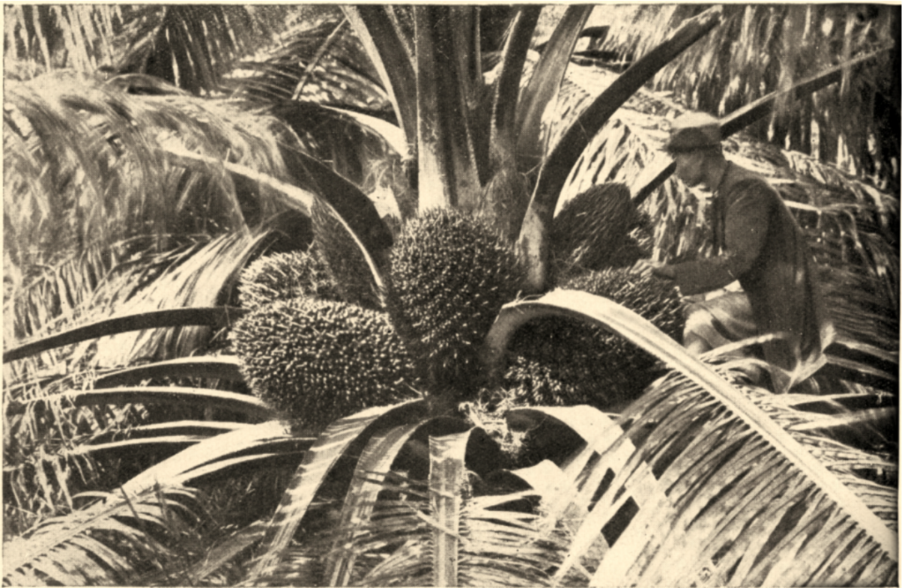
A worker posed next to gigantic fruit bunches, the result of artificial pollination.

When Europeans carried Elaeis guineensis from its homeland in western Africa to Southeast Asia in 1848, they left its native pollinators behind. Initially, that didn't matter: after failed experiments with palm oil production, the trees were relegated to ornamental roles. That changed in 1911, when the first large-scale oil palm plantations broke ground, hoping to compete with Africa's long-established export trade in palm oil. Plantation managers dealt with pollination the same way they built their plantations and harvested palm fruit, with cheap labor. Workers bound by coercive "coolie" contracts carried out this reproductive work, gathering pollen and dusting it onto female flowers, marking each blossom with a dot of paint to prove the work was done.