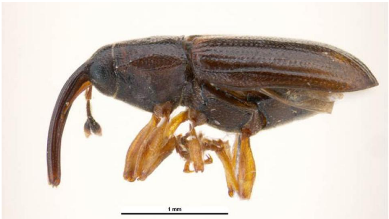
A female oil palm weevil, Elacidobius kamerunicus .

We do not yet know whether its danger as an enemy is not greater than its usefulness and we do not know what ill we may perhaps be importing. (Heusser 1922: 55)