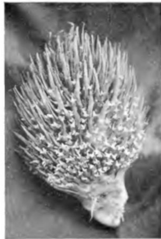
Fig. 2. Vrouwelijke bloeiwijze.