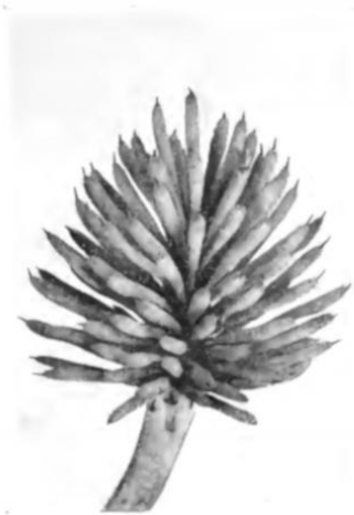
Fig. 1. Mannelijke bloeiwijze

smallholder activism, and freedom from colonial rule remade the political economy of labor for the plantations. The palms had their own agenda, too: now over 20 years old, most plantation palms in the region had grown to towering heights by the 1940s. Pollinating and harvesting fruit became slow and hazardous tasks accomplished on ladders. For the tallest palms, plantation managers let the wind and native insects like Thrips hawaiiensis do the work. Many plantations began cutting down and replacing palms with higher-yield hybrids in the 1960s, restarting the cycle.