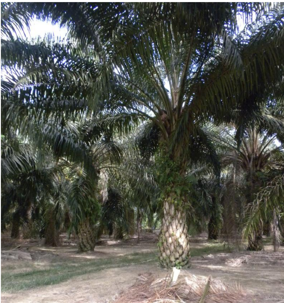
A mature oil palm plantation near Melaka, Malaysia.

The first oil palm plantations relied on human interventions for the sexual reproduction that made the palm oil industry possible. Scientists discarded evidence about insect pollinators, only to rediscover them later in the twentieth century. The “million dollar weevil” transformed oil palm cultivation in Southeast Asia, but new problems with disease and hybrid trees cast shadows over its future.