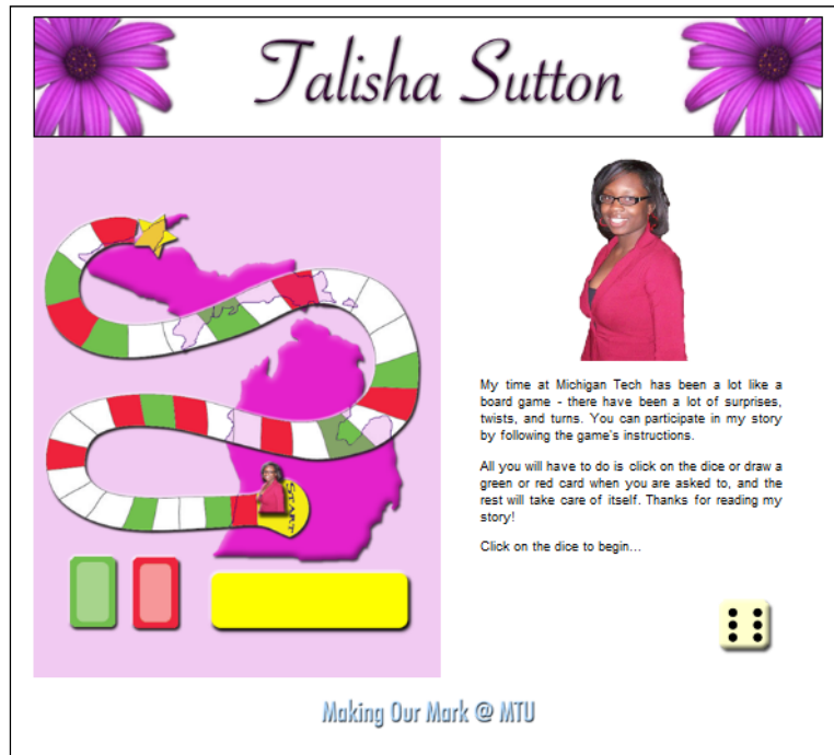
Figure 7 - A 2008 narrative with a thematic design based on a board game

of identity. For example, a 2008 author (Sutton) builds her narrative around the metaphor of a board game (Figure 7). The readers navigate by rolling the dice and drawing cards. As the reader reads through the narrative, the game piece moves forwards and backwards towards its goal (graduation) as the cards of chance deal out scenarios such as making friends, having a baby, finding a balance, and studying.