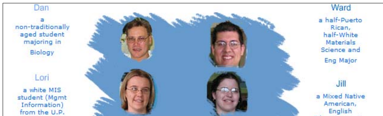
Figure 1 – Identity labels on the 2002 Making Our Mark homepage