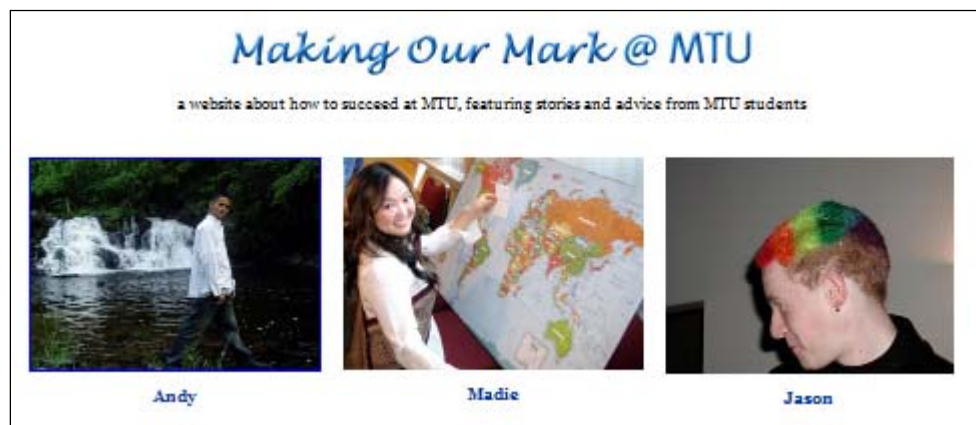
Figure 3 – Part of the 2007 Making Our Mark homepage

Given Michaels and Sohmer’s argument, one can see a rationale behind the choice to eventually drop identity labels from the project. The first step towards this occurred in 2006, when an author did not include a label in the title of her page (LaCasse 2006). A year later in 2007 there was a sudden shift to no longer using explicit labels for the writers (Figure 3). Oftentimes the written or visual narratives themselves showed some dimensions of difference, but the writers no longer included a one sentence declaration of identity.