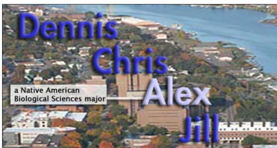
Figure 2 – A student's identity label on the 2005 Making Our Mark homepage