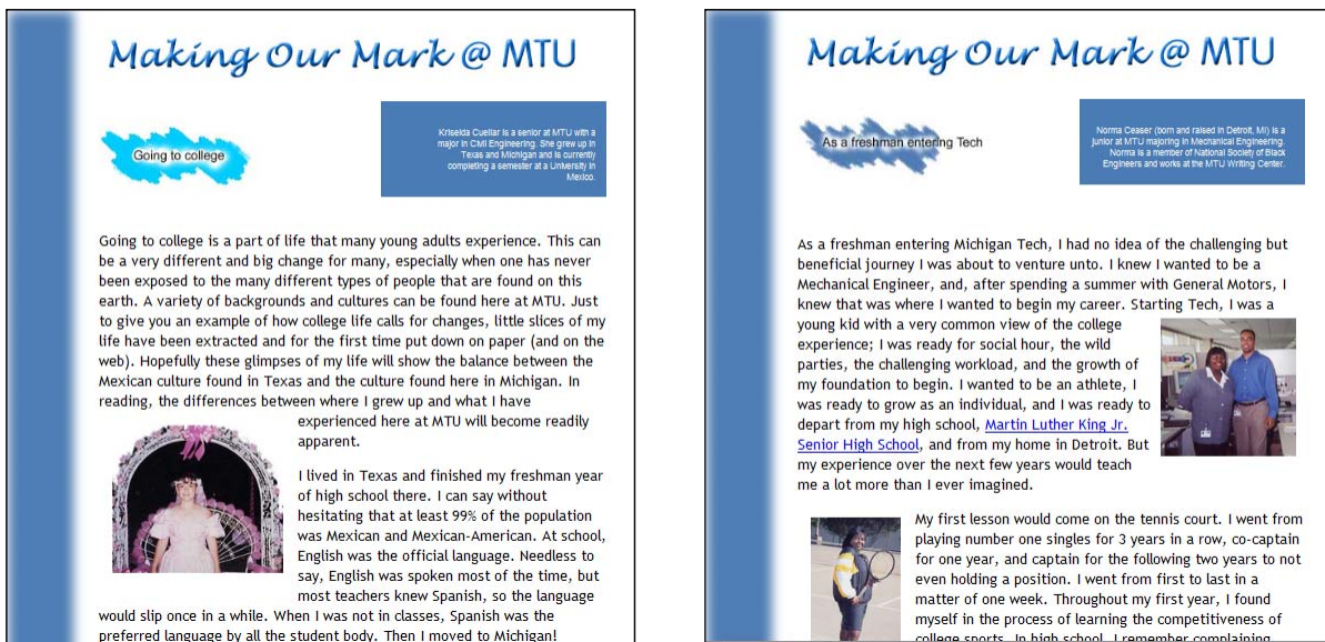
Figure 4 – Two stories from the 2002 website

The first group of narratives I would like to examine spans from 2002 to 2004, during the coordination of Katherine Valentine. While each narrative was presented as a separate section of the website, each narrative had an extremely standardized visual design in terms of color, layout, typography, etc., although there is little record of these choices ( Making Our Mark , 2002, 2003, 2004). Two such stories, both from 2002, are shown in Figure 4; all other narratives for that year (and following years) follow the same visual format. While the designs on each year’s homepage changes, the layout of the narratives themselves is exactly the same from 2002-2004.