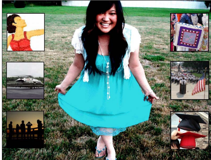
Figure 6 – The navigation page of a 2007 narrative

So, this level of visual design could fall somewhere on the spectrum between superficial multiculturalism and productive diversity, depending on the audience of the story and the reasons made for the design choice.