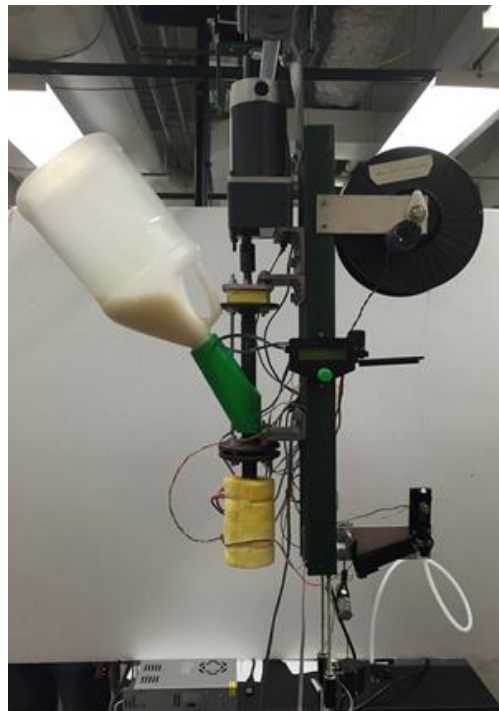
Figure 3. Vertical recyclebot. The white hopper is on the upper left and the black spooler is on the upper right. The motor in the upper middle drives an auger that feeds plastic into the hot zone (insulated in yellow). Filament is produced and looped through a light sensor to maintain the loop length, and thus the filament diameter, automatically. In this setup, the length and diameter can be measured continually.