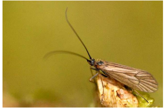
Figure 5. Enoicyla pusilla adult, a species whose larvae live among terrestrial mosses.

Green (1997) reported that in the UK the larvae of Enoicyla pusilla (Figure 3) feed on the soft tissues of dead leaves, mosses, and algae. In one observation, 50 or more individuals were actively climbing up logs and apparently browsing on black slime molds (Green 2012). Their requirement for nearly 100% humidity limits their terrestrial habitats. They have no gills and must rely on cutaneous respiration. If they get too wet, they climb upward and "hang themselves out to dry." When the humidity decreases to 70%, they drop again to the ground. Sometimes many larvae occur together on the surfaces of mosses and liverworts on stream banks after a rain (Green & Westwood 2005; Green 2012).