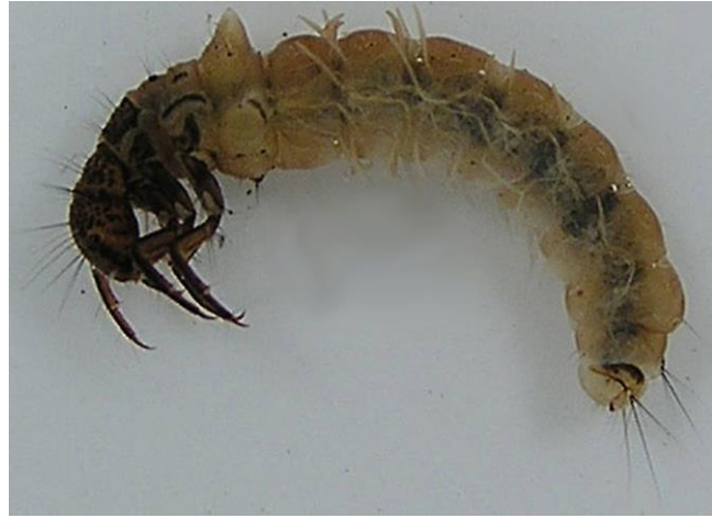
Figure 7. Limnephilus sp. larva; L. peltus burrows into mosses to pupate.

the family to clean the silk disks that close the case. The first abdominal segment lacks posterior rugosity, and there are no swimming legs. The larvae, however, live in water courses that have cold summer temperatures (3-5°C). The authors consider these cold brooks to have less food competition, thus favoring the larvae of this species.