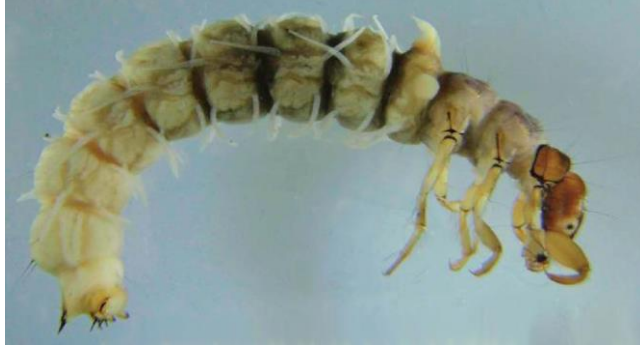
Figure 9. Hagenella clathrata larva, a species that lives in bogs.

Buczyńska et al. (2012) searched for the rare Hagenella clathrata (Phryganeidae; Figure 9-Figure 10) in Poland. This species is associated with bogs, making it even more threatened due to habitat destruction. This research team was able to collect larvae in the mountain area using Barber pitfall traps, indicating their mobility in terrestrial habitats.