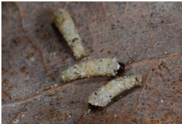
Figure 3. Enoicyla pusilla larvae, a species that inhabits mosses and leaf litter.

We now know that there are three species of terrestrial Enoicyla ( Limnephilidae ; Figure 1) in Europe, and that larvae of these live in the humid and temperate mosses of deciduous forests and rock crevices (Crampton 1920; Meidl & Molenda 2000), often far from water (Crampton 1920). Perhaps the best known of these terrestrial larvae are those of Enoicyla pusilla (Figure 3-Figure 5). These larvae build cases from fine grains of sand and vegetable matter among mosses (Butler 1886). In Britain, Enoicyla pusilla is restricted to woodlands, and Harding (1998) suggested that it may have been accidentally introduced from the European continent. This species has five larval instars, becoming more scarce by late summer. Eggs hatch in October and November, and larval success may depend on rainfall during those months. The larvae of this species typically occur among mosses and leaf litter.