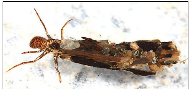
Figure 2. Pycnopsyche guttifera larva, a larva that eats terrestrial mosses when they become submersed.

Some aquatic larvae are able to feed near the surface of water. The aquatic Pycnopsyche guttifera (Figure 2) will sometimes eat terrestrial mosses, but this occurs when the mosses are just below the water line (Williams & Williams 1982).