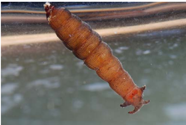
Figure 35. Limnophora riparia larva, a species that lays its eggs, develops, and pupates in mosses as a preferred site.