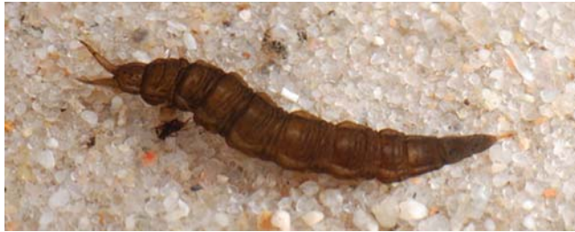
Figure 3. Atherix ibis larva, a stream-dweller that can be found among bryophytes.

This family is not well represented among bryophytes. Atherix ibis (Figure 3) includes bryophytes among its substrates in streams (Neveu 1976). The larvae eat small invertebrates (McLeod 2005), most likely finding the bryophytes to serve as an adequate dinner table. In Carpathian streams, this species is positively correlated with stream order and warmer water temperatures (Bulánková & Duricková 2009). Its eggs are laid on overhanging leaves and hatched larvae slide into the water; the larvae are henceforth very sensitive to desiccation. They are, however, quite tolerant of human activity and pollution.