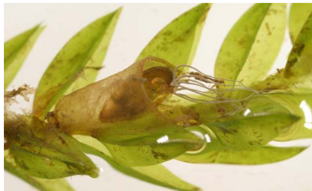
Figure 23. Simulium aureum pupa with cocoon where the empidid Hemerodromia brevifrons sometimes lives.