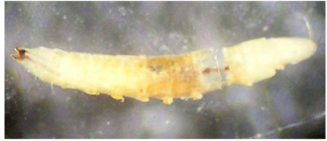
Figure 18. Neoplasta larva, a bryophyte inhabitant.

Harper (1980) found that Hemerodromia (Figure 12-Figure 13), Neoplasta (Figure 18-Figure 19), and Roederiodes (Figure 20) in the Laurentian watershed, Quebec, Canada, typically inhabit the mainstream and the larger tributaries. These species usually prefer fast water with a substrate of moss and rubble.