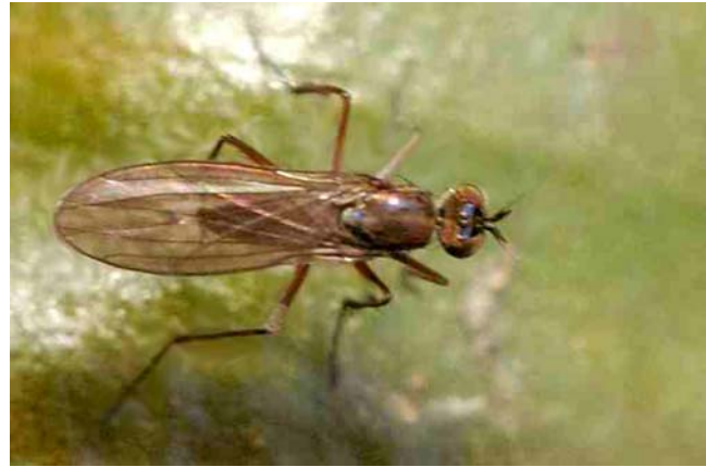
Figure 10. Hydrophorus praecox adult, member of a genus that can be found among Appalachian Mountain stream bryophytes.

These are small flies with a worldwide distribution and that can be aquatic, but can also live in semiaquatic habitats, in dung, in bird nests, among roots, and associated with fungi (Cresswell 2004). Larvae mostly feed on decaying matter, but also can be predatory.