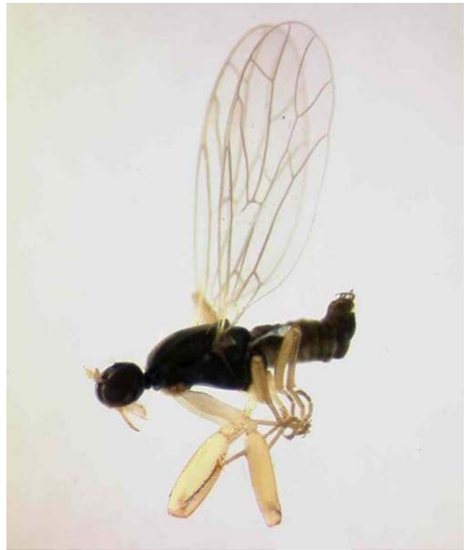
Figure 19. Neoplasta adult, a genus with larval bryophyte inhabitants.