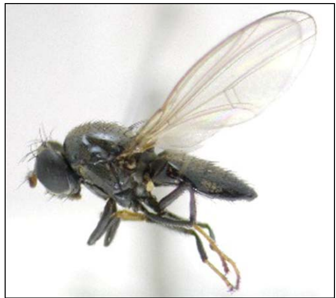
Figure 28. Gymnoclasiopa taxoma adult. Gymnoclasiopa plumosa breeds in forest mosses.