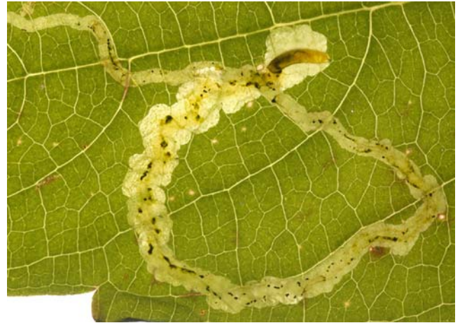
Figure 31. Phytoliriomyza melampyga larva showing leaf mine trail in a tracheophyte leaf.

The leaf miner Phytoliriomyza mesnili (see Figure 31) develops successfully on the floating liverwort Ricciocarpus natans (Figure 32) (d'Aguilar 1945). It also occurs on Riccia beyrichiana (Figure 33) where the larva feeds within the thallus, then pupates there. This miner is known exclusively from liverwort and hornwort thalli.