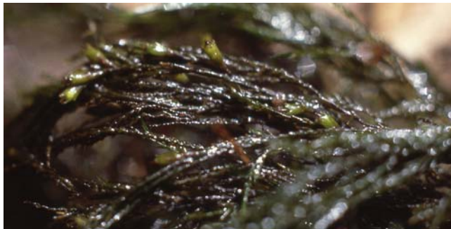
Figure 4. Fontinalis dalecarlica with capsules, home to Atherix variegata in Appalachian Mountain, USA, streams.

In the acid streams in the Appalachian Mountains, USA, Atherix variegata occurred in all of the common moss habitats [ Fontinalis dalecarlica (Figure 4), Hygroamblystegium fluviatile (Figure 5), Platyhypnidium riparioides (Figure 6), and Scapania undulata (Figure 7)] (Glime 1968).