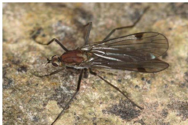
Figure 24. Wiedemannia bistigma adult, a species whose larvae can live among stream mosses.

Some adult members of the family devour their food from invertebrates trapped by the surface film. Wiedemannia bistigma (Figure 24) adults climb about on floating algae for just this purpose (Laurence 1953). Like maggots on a road kill, the empidids gather in numbers on the carcass of a dead insect. This adult behavior may not be as effective for most larval bryophyte-dwellers because the bryophyte habitats are often in fast water.