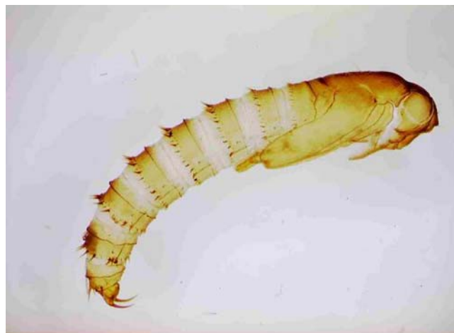
Figure 15. Clinocera nigra pupal exuvia.