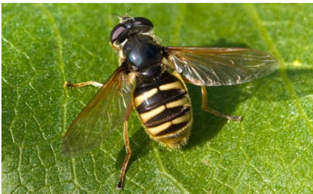
Figure 26. Sericomysia silentis adult, member of a genus in which some larvae live in bog pools. This one, like many syrphids, is a bee mimic.

These worldwide flies are mostly 10-20 mm long, but can range up to 35 mm (Bartlett 2004). Many of the terrestrial larvae live in ant nests, but some occur in bogs. The larvae are mostly predators, although the family include a wide range of food sources. Some aquatic members have a long breathing tube, earning them the name of rat-tailed maggots. Sericomysia borealis (Figure 26) larvae occur in pools of peat bogs (Bloomfield 1897).