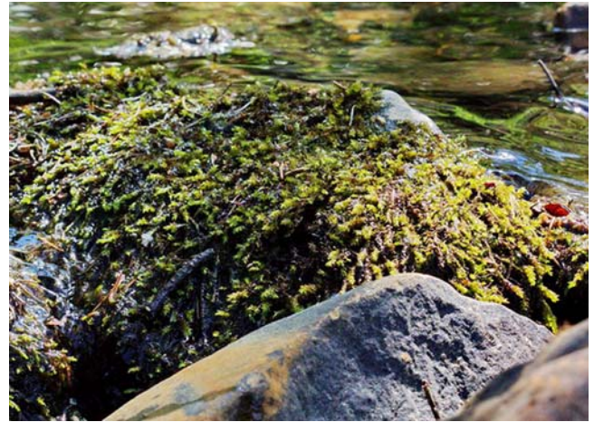
Figure 6. Platyhypnidium riparioides , home to Atherix variegata in Appalachian Mountain streams. Photo by Andrew Spink, with permission.