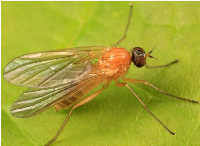
Figure 25. Oreogeton sp. adult. Larvae in this genus are sprawler-burrowers among mosses, feeding on blackflies and caddisflies.

The genus Oreogeton (Figure 25) associates with mosses, but they are sprawlers-burrowers that engulf their prey, including blackflies and caddisflies (Aquatic Insects 2008; National Park Service 2014). These prey insects may be the reasons they enter the moss realm.