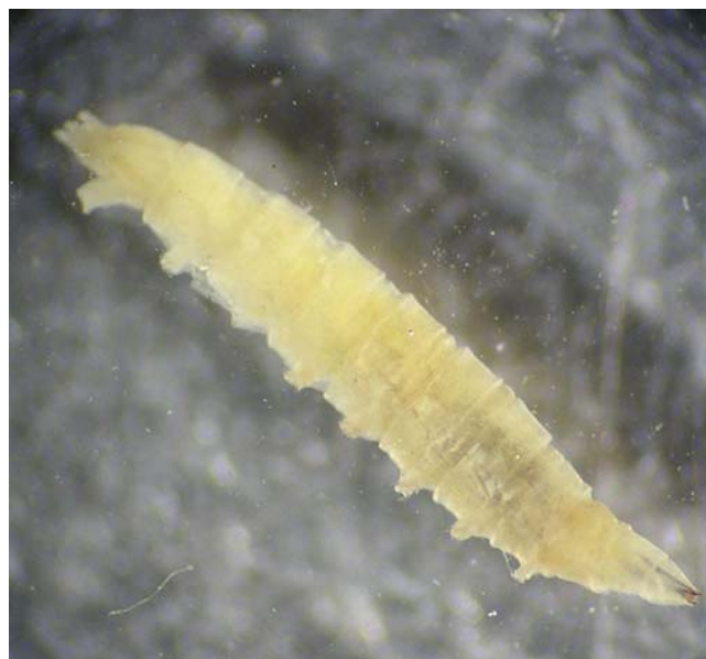
Figure 14. Clinocera larva, an inhabitant of mosses in swift streams. Photo from <www.dfg.ca.gov>, through public domain.