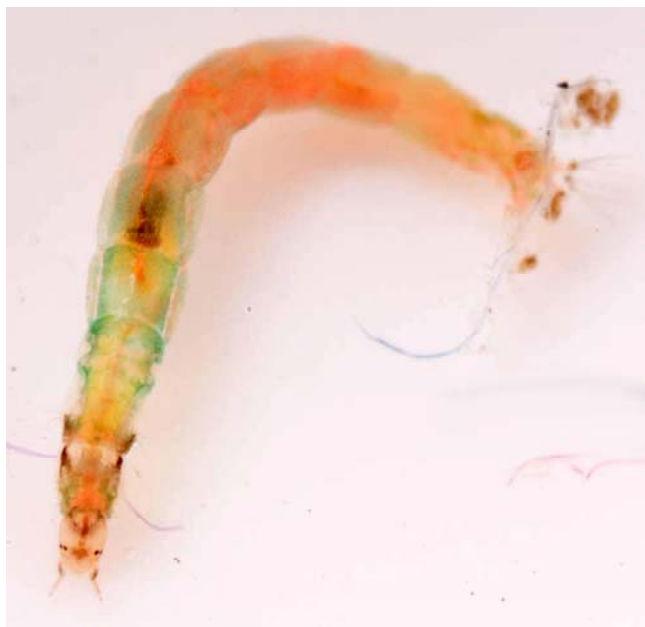
Figure 22. Rheotanytarsus sp. larva from the above tubes. This genus inhabits mosses and other sites.