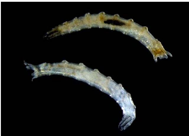
Figure 9. Hydrophorus oceanus larvae, member of a genus that sometimes occurs among stream bryophytes.

This family does not seem to be reported as a moss dweller, but it does occasionally live among mosses in the Appalachian Mountain, USA, streams (Glime 1968). I was able to identify Hydrophorus larvae (Figure 9-Figure 10) in these collections. But it is also possible that they fell in or got swept in by flooding.