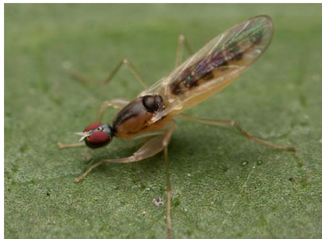
Figure 13. Hemerodromia superstitiosa female adult, member of a genus with moss-dwelling larvae.

Bischoff (1924a) reported that the genus Clinocera occurred (Figure 14-Figure 15) among mosses in swift streams. In Malaysia, the larvae, like those of Hemerodromia , live at least 10 cm below the water surface in the hyporheic zone and exchange oxygen directly through the cuticle (Grootaert 2004). Sinclair (2000) described a new species, Clinocera gressitti (Figure 14), from mosses on submerged stones in New Zealand. Adrian Plant (pers. comm. 27 August 2014) observed that members of this genus often pupate (Figure 15) among the mosses.