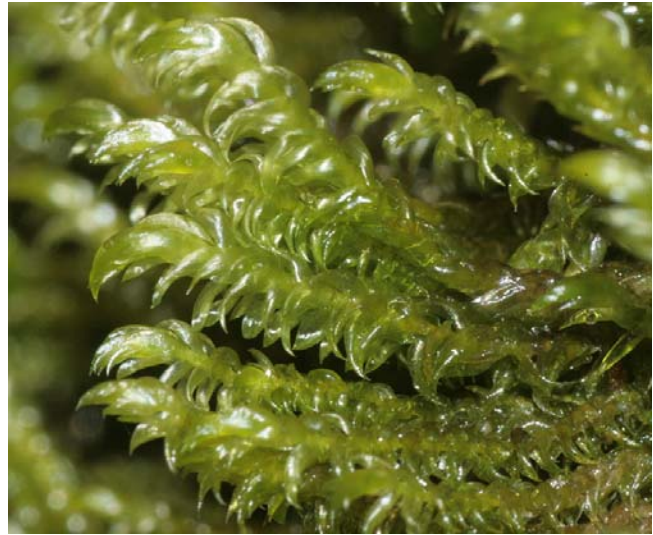
Figure 36. Hygrohypnum luridum , home to Limnophora larvae in mid-Appalachian waterfalls.

The larvae of Limnophora riparia (Figure 35) hatch from the egg as a third instar larva and are immediately ready to prey upon living invertebrates (Merritt & Wotton 1988). One of their peculiar adaptations is to attach the anterior of their prey and to remove and digest the contents of the head and body, leaving the cuticle and guts behind. The life cycle is synchronized with the main prey item, larvae of the blackfly Simulium noelleri , and other invertebrate prey items so that there is always plenty of food for the developing larva. When the larva matures, it continues to select mosses for its site to pupate.