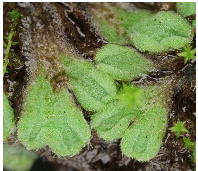
Figure 33. Riccia beyrichiana with eggs deposited in a cavity made on the left thallus. This liverwort species serves as home for larvae of the agromyzid fly Phytoliriomyza mesnili .