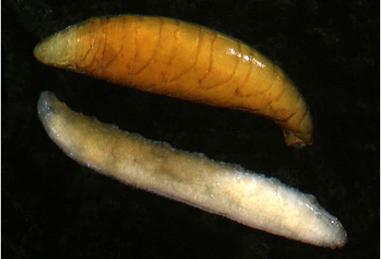
Figure 1. Limnophora sp. larva ( lower ) and pupa ( upper ) ( Muscidae ), occasional bryophyte inhabitants.