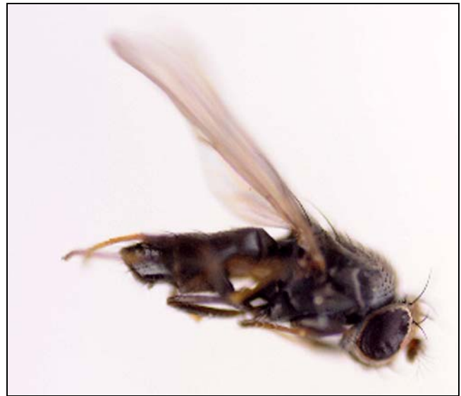
Figure 27. Discocerina obscurella adult, a genus that burrows into moss mats at water's edge.

This is not typically a bryophyte family. Discocerina (Figure 27) burrows into moss mats or lives among algae at the borders of streams, ponds, and lakes (Merritt et al. 1996). Gymnoclasiopa plumosa (see Figure 28) breeds in algae and mosses in the forest (Grünberg 1910).