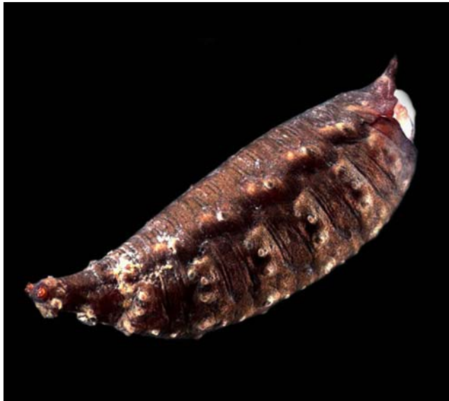
Figure 30. Sciomyzidae pupa; some species pupate among mosses.