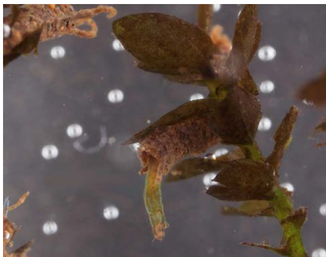
Figure 21. Rheotanytarsus exiguus larval tubes made by the moss inhabitant larvae, but these tubes also house the larvae of Hemerodromia empiformis .

cobble (Merritt & Cummins 1996), but also live in mosses at or just above the water level (Brammer et al. 2009). Larvae of Hemerodromia consume blackfly larvae that are living on the mosses (Vaillant 1953). Some of these Empididae , especially Hemerodromia , larvae have an interesting habitat choice, living in cases and nets of other insects. Larvae of the Hemerodromia empiformis complex have been found inside the tubes of the midge Rheotanytarsus (Figure 21-Figure 22) in southern California, USA. The last instar larvae and pupae of H. brevifrons have been found inside cocoons of Simuliidae (Figure 23) in a stream in Los Angeles County, California, USA. Pupae of a South American Neoplasta (Figure 18) can occur inside cocoons of caddisflies (Brammer et al. 2009). Thus their habitation of mosses may be indirect.