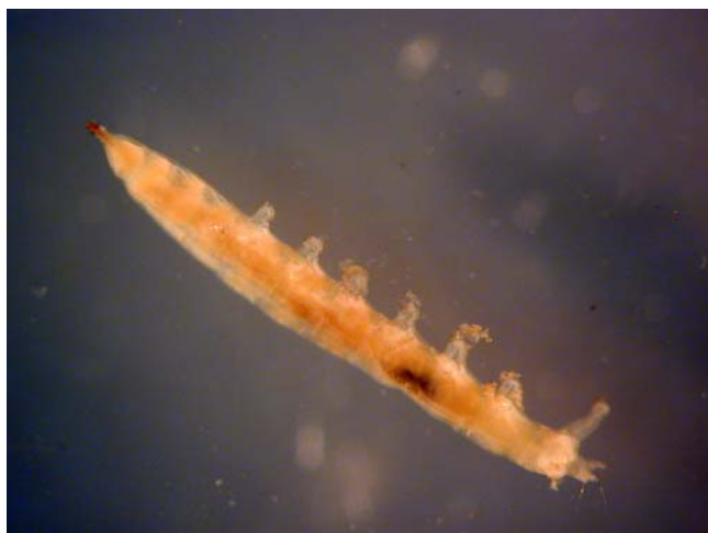
Figure 12. Hemerodromia larva, a frequent bryophyte inhabitant.

Bischoff (1924a) reported that the genus Clinocera occurred (Figure 14-Figure 15) among mosses in swift streams. In Malaysia, the larvae, like those of Hemerodromia , live at least 10 cm below the water surface in the hyporheic zone and exchange oxygen directly through the cuticle (Grootaert 2004). Sinclair (2000) described a new species, Clinocera gressitti (Figure 14), from mosses on submerged stones in New Zealand. Adrian Plant (pers. comm. 27 August 2014) observed that members of this genus often pupate (Figure 15) among the mosses.