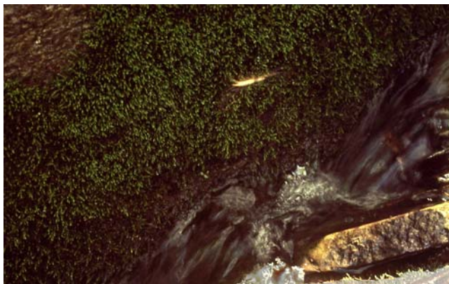
Figure 5. Hygroamblystegium fluviatile , home to Atherix variegata in Appalachian Mountain streams.