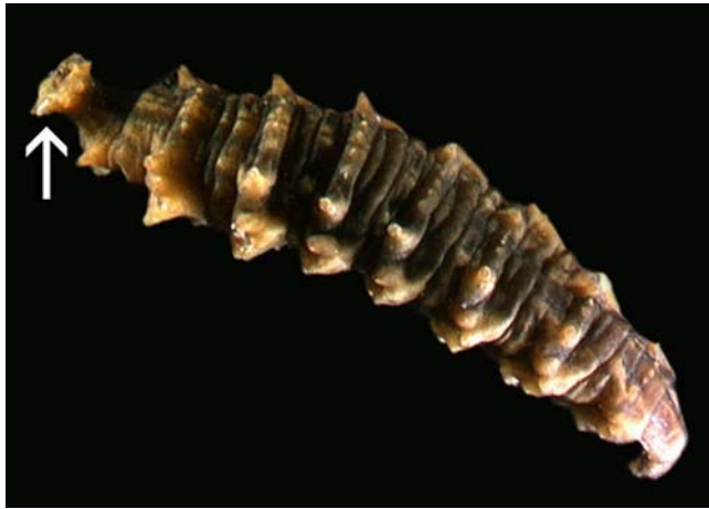
Figure 29. Sciomyzidae larva indicating spiracular disc.

live around marshes, lakes, ponds, and wooded areas, but the larvae are aquatic (Leung 2004). These larvae feed on snails, either as predators or parasites. Poecilographa decora is the only American species in this genus (Usinger 1974). Its pupae are known from woodland mosses.