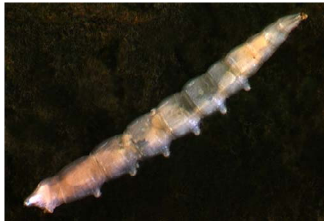
Figure 11. Empididae , a frequent larva on bryophytes in streams.

The Empididae (Figure 11) are little flies, so it is not any surprise to find them among mosses as larvae. In fact, larvae and pupae of many species occur among mosses in streams (Ivković et al. 2007).