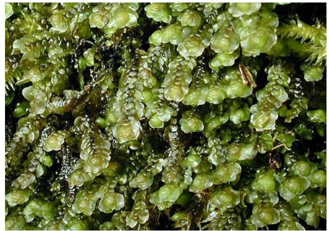
Figure 7. Scapania undulata , home to Atherix variegata in Appalachian Mountain streams.

In the Plitvice Lakes National Park in the Dinaric karst region of Croatia, the Athericidae preferred moss on tufa ( P < 0.05 , n = 12 ) (Čmrlec et al. 2013). These flies pupate on mosses, and that substrate is the preferred substrate for emergence of the adults (Thomas 1997; Čmrlec et al. 2013).