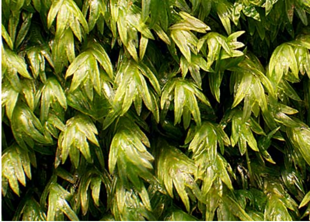
Figure 16. Fissidens rigidulus , home for Empididae in torrents.

In a springbrook in the Southern Alps of New Zealand, Cowie and Winterbourn (1979) found three zones of bryophytes. In the torrential waters near the middle of the channel, Empididae (Figure 11) were among the most abundant species living among Fissidens rigidulus (Figure 16). Not surprisingly, these were accompanied by several abundant species of Chironomidae (see Chapter 11-13b).