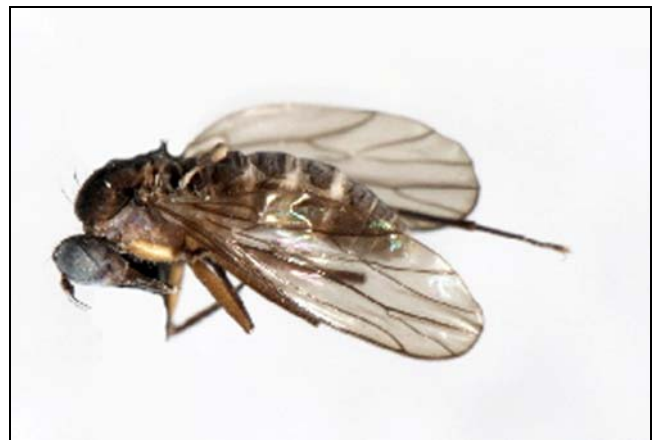
Figure 20. Roederiodes recurvatus adult, a genus whose larvae are associated with mosses in fast water in the Laurentian watershed of Canada.

Hemerodromia (Figure 12-Figure 13) larvae occur primarily in lotic habitats and among mosses on stream