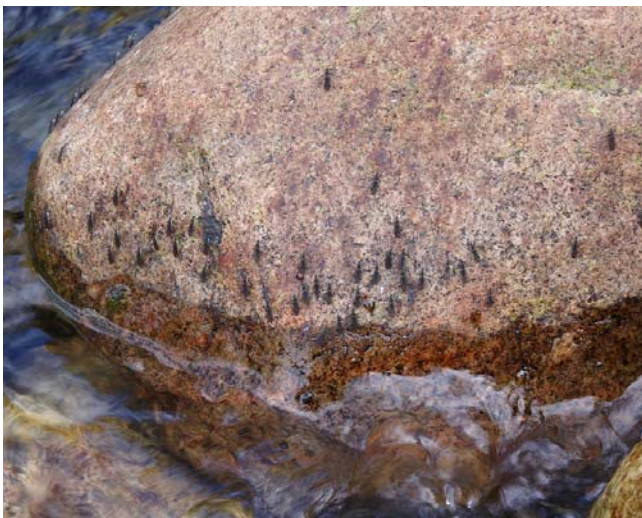
Figure 17. Wiedemannia bistigma emerging on stones.

In a German stream, larvae of Wiedemannia bohemani (see Figure 17) were abundant in the middle reach, with many occurring in partly submerged mosses on stones, both at and below the water level (Wagner & Gathmann 1996). Vaillant (1967) likewise found both larvae and pupae of Wiedemannia in streams and rivers of France, with adults remaining nearby on stones that were partially submerged. The larvae feast on the Chironomidae that are so abundant among mosses.