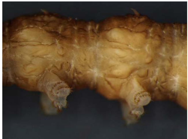
Figure 2. Atherix ibis larva showing crochets in two rows in each proleg.

The larvae of these flies occur in pristine streams with the adults nearby (Kits 2005). They include predaceous members that eat other invertebrates, including caddisflies, and saprophagous members on wooden debris (Athericidae 2014). The larvae are distinguished by crochets on their abdominal prolegs (Figure 2), permitting them to live in rapid montane streams and torrents without being washed away.