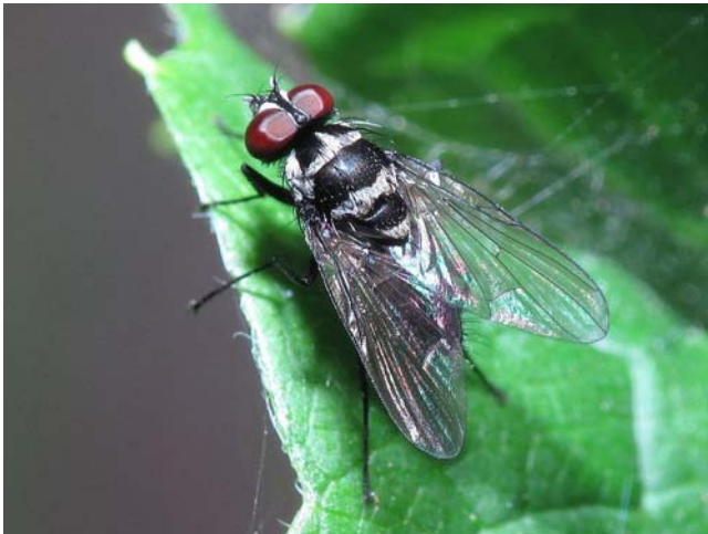
Figure 34. Limnophora adult, a genus where some members use mosses for egg-laying, larvae, and pupae.

Many species of Limnophora (Figure 1, Figure 34- Figure 35) carry out their larval development among mosses and liverworts in running water where they are able to prey on oligochaetes (segmented worms such as earthworms) and small insect larvae (Glime 1968; Skidmore 1985; Roper 2001). In the Appalachian Mountain, USA, streams these occur most abundantly among clumps of Hygrohypnum luridum (Figure 36), especially in small waterfalls (Glime 1968). Axelrod and Vorderwinkler (1983) found that the European muscid fly Limnophora riparia (Figure 35) prefers mosses as a substrate; it is a good place to eat chironomid, blackfly, and other larvae (Wotton & Merritt 1988). This species typically lives among bryophytes in waterfalls, splash zones, and lake outlets. When the larvae were placed under water in enamel trays, all of them drowned within 24 hours. They burrow into any possible substrate to avoid light.