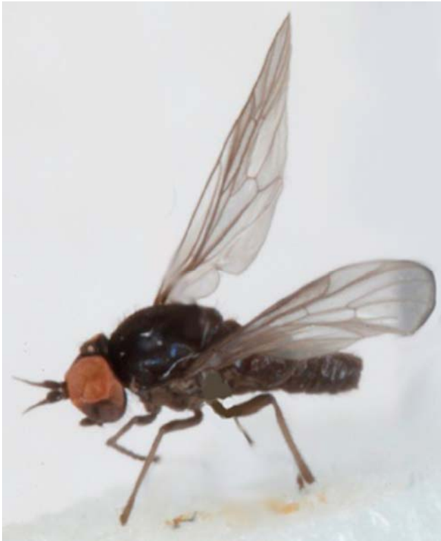
Figure 8. Spania nigra adult, a species with a larval bryophyte dweller in Sussex.

This family does not seem to be reported as a moss dweller, but it does occasionally live among mosses in the Appalachian Mountain, USA, streams (Glime 1968). I was able to identify Hydrophorus larvae (Figure 9-Figure 10) in these collections. But it is also possible that they fell in or got swept in by flooding.