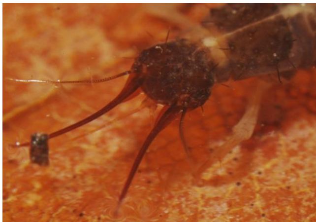
Figure 5. Osmylus fulvicephalus larva showing large jaws.

Osmylus fulvicephalus (Figure 3) is controversial in that its larvae live in wet mosses, but drown in 8-28 days of submersion (Elliott et al. 1996). Nevertheless, they do enter the water in search of food. It seems safe to say, however, that their relationship with mosses is damp, but not aquatic. The larva feeds among these mosses. When movement is detected, it jabs at it with the long proboscis, then injects it with a salivary secretion that paralyzes it. A chironomid larva is paralyzed within 10 seconds. The O. fulvicephalus then sucks out the interior of the prey. The larvae stop eating during mid autumn and burrow down to the moss rhizoids to hibernate for the winter. Fortunately, in this state they can survive occasional submersion in water, thus surviving spates (sudden flood in a river, especially one caused by heavy rains or melting snow). In spring they spin a silken cocoon, sometimes incorporating bits of moss in the cocoon. Just before pupation the long jaws break off (Figure 5). The pupa becomes immobile during pupation. It grows a pair of mandibles that it uses to cut its way out of the cocoon.