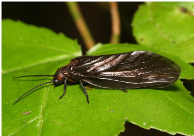
Figure 14. Sialis adult, a genus that sometimes pupates and lays eggs among streamside bryophytes.

I have only found reference to one genus of bryophyte dwellers, Sialis (Figure 13-Figure 17) (Lithner et al. 1995). I likewise found this genus occasionally among bryophytes in Appalachian Mountain, USA, streams (Glime 1968). It has aquatic larvae, but adults are terrestrial and lay eggs near water (Alderfly 2014). Fully grown larvae of Sialis pupate in soil, mosses, under stones, and other locations, usually near water. In Canada, after about one month the adults appear. Sialis nigripes prefers mosses for egg laying (Elliott et al. 1996). Sialis lutaria (Figure 15-Figure 17) was used in a study comparing heavy metal accumulation in mosses ( Fontinalis spp.; Figure 18), insects, and fish (Lithner et al. 1995).