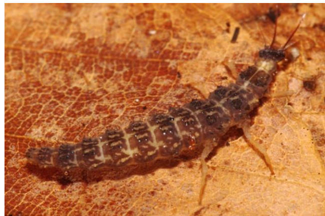
Figure 2. Osmylus fulvicephalus larva, a species that lives among mosses on streambanks and feeds there.

mosses (Elliott et al. 1996) near water, laying about 30 eggs either singly or in pairs. Larvae leave the egg site within 1-3 days to burrow into mosses. Larvae may live in or out of water, but pupation is on land, lasting 7-18 days. If the larvae are submersed, they crawl out of the water (Ward 1965). If the moss is submersed, they burrow deeply into it, but within 8-28 days of submersion they die. Adults live two weeks to three months, depending on species and location.