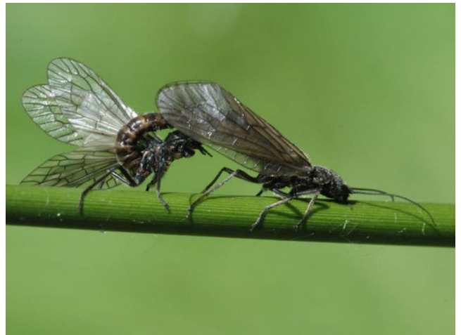
Figure 17. Sialis lutaria adults mating.

On the South African Cape, pupae of Sialidae along streams or waterfalls live in Sphagnum (Figure 19) and other mosses (Barnard 1931). These pupae require a wet, but not submersed, habitat, so the mosses must be soaking wet.