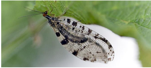
Figure 3. Osmylus fulvicephalus adult that lays its eggs on overhanging vegetation. Larvae live among streambank mosses.