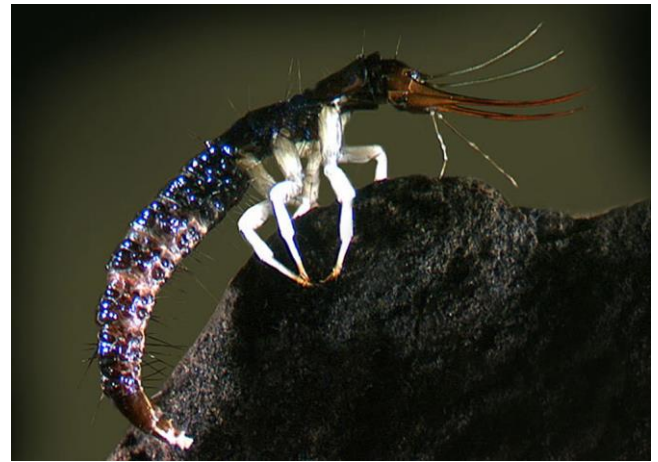
Figure 6. Kempynus sp larva, member of the small family Osmylidae that inhabits mosses near streams.

Like Osmylus fulvicephalus (Figure 2-Figure 5), Kempynus sp. (Figure 6) in the Southern Alps of New Zealand is somewhat amphibious, living at the edge between water and land (Cowie & Winterbourn 1979). In springbrooks it lives in clumps of the mosses Acrophyllum quadrifarium (= Pterygophyllum quadrifarium ; Figure 7) and Cratoneuropsis relaxa (Figure 8).