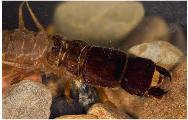
Figure 20. Nigronia serricornis larva showing powerful jaws. The aquatic larva often crawls into mosses to pupate.

Nigronia , an aquatic member of the Corydalidae , is not typically a moss inhabitant, although I did occasionally find larvae of this genus among Appalachian Mountain stream bryophytes (Glime 1968). But like many other aquatic insects, Nigronia serricornis (Figure 20-Figure 21) pupates among mosses as well as under stones and logs (Needham et al. 1901). Likewise, Chauliodes pectinicornis (Figure 22) and C. rastricornis (Figure 24-Figure 24) pupate in these habitats. Pupation lasts about 2 weeks in these Corydalidae .