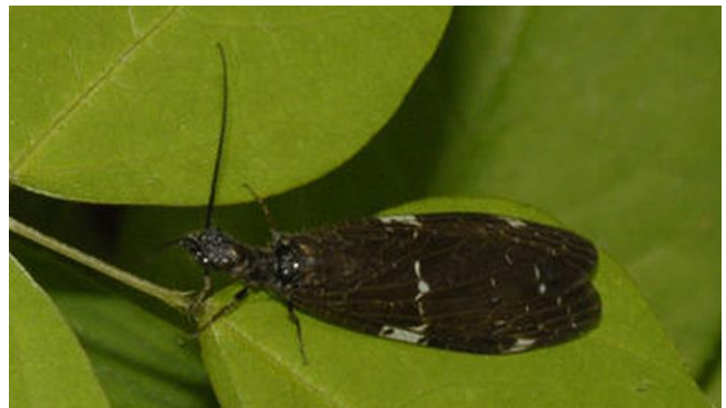
Figure 21. Nigronia serricornis adult. Pupae of this insect often reside in mosses.