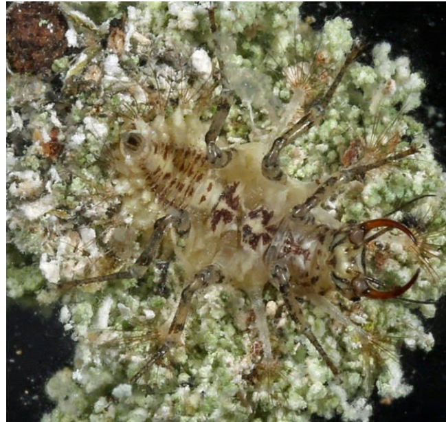
Figure 11. Leucochrysa pavida larva showing ventral side. Photo by Jim McCormac, with permission.