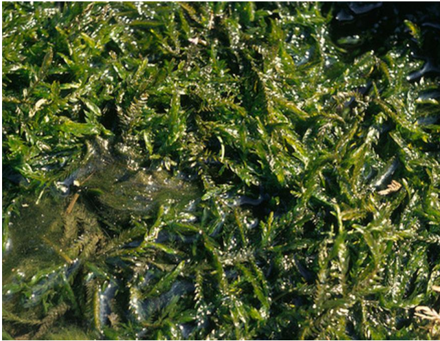
Figure 18. Fontinalis antipyretica , home to numerous kinds of insects and useful for comparing heavy metal accumulation.