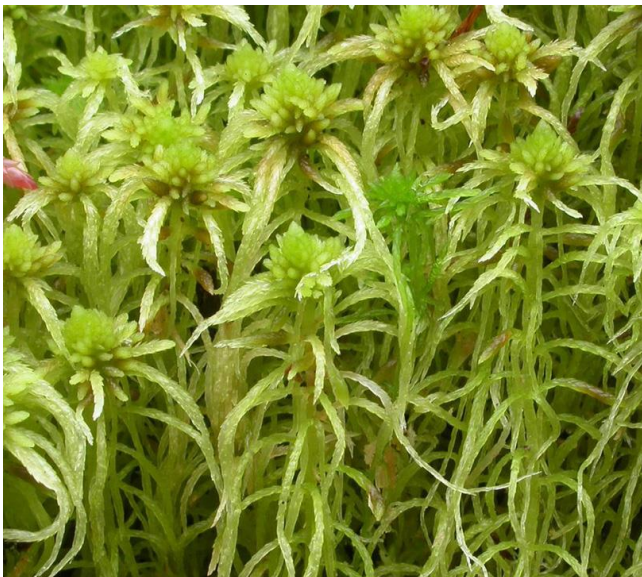
Figure 19. Sphagnum fimbriatum , a genus that lives in Africa and is a potential home for pupae of Sialidae .