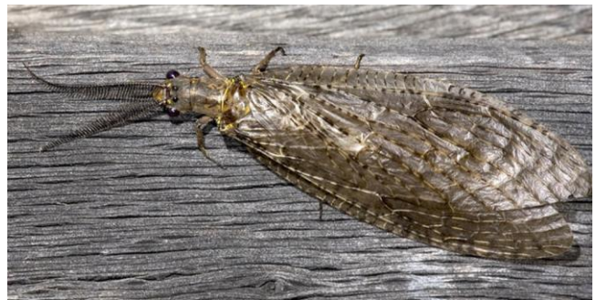
Figure 22. Chauliodes pectinicornis adult, a species that lives in the water as larvae and pupates among mosses.