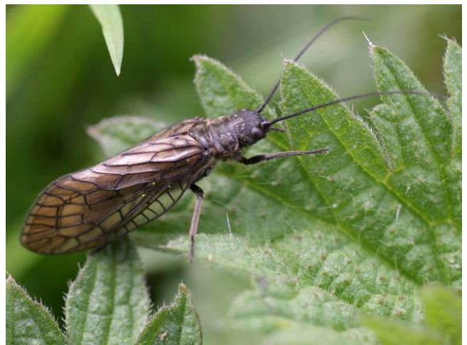
Figure 16. Sialis lutaria adult.