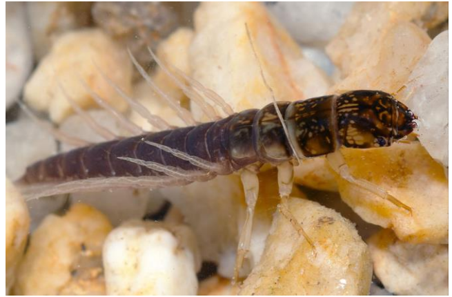
Figure 15. Sialis lutaria larva, the aquatic stage that migrates into the water, sometimes from streamside bryophytes.