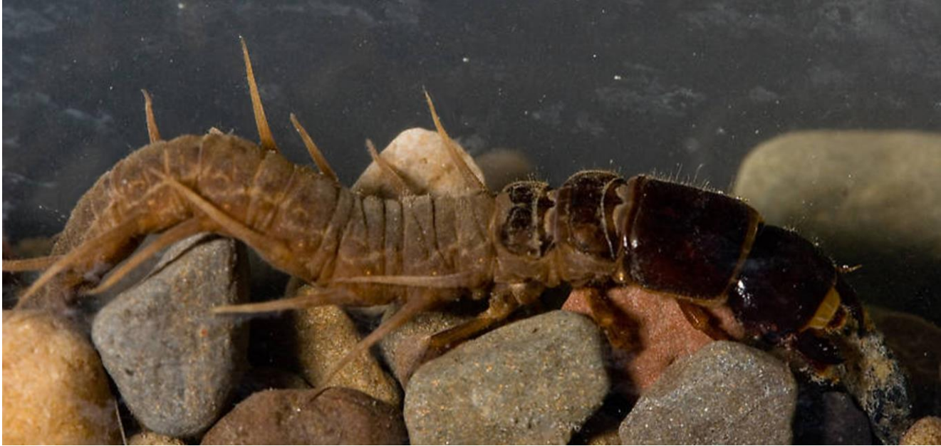
Figure 1. Nigronia serricornis larva (Megaloptera), a species that sometimes pupates in mosses.