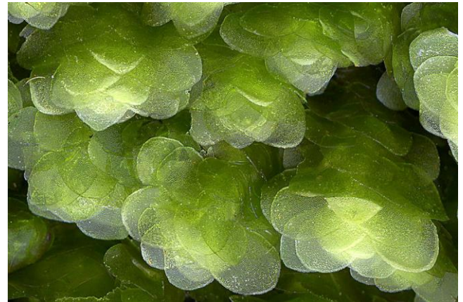
Figure 7. Pterygophyllum quadrifarium , a moss habitat for Kempynus sp. at stream borders and in springbrooks in New Zealand.