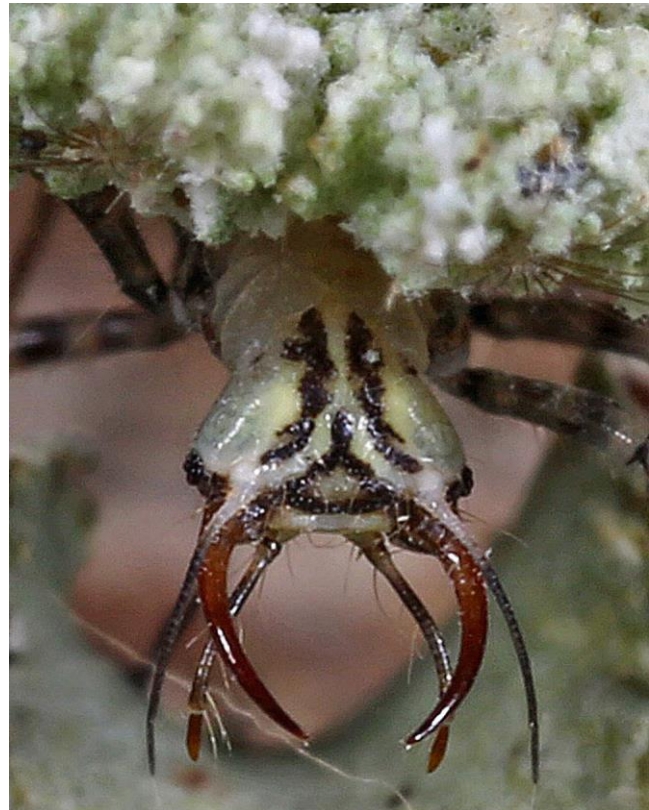
Figure 12. Leucochrysa pavida larva showing head and large mandibles of this carnivore.