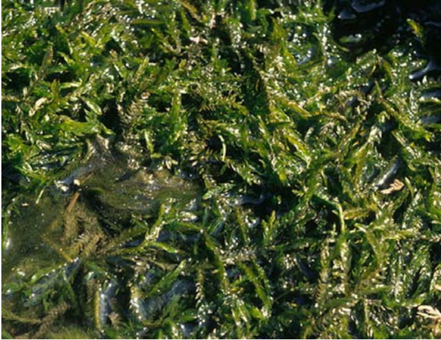
Figure 19. Fontinalis antipyretica , home to numerous kinds of insects and useful for comparing heavy metal accumulation.