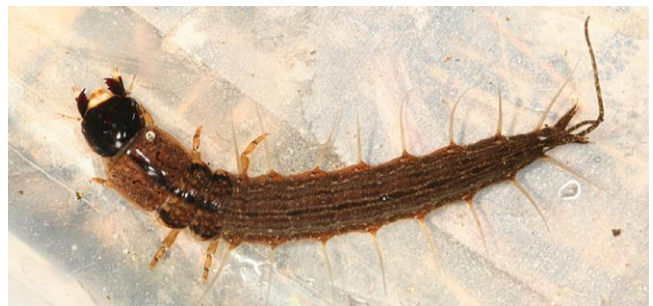
Figure 23. Chauliodes rastricornis larva, a species that may move to mosses to pupate.