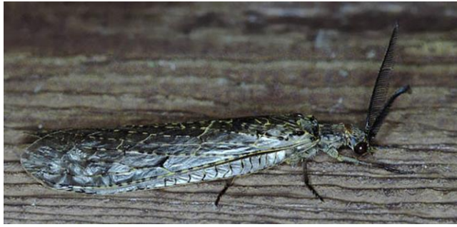
Figure 24. Chauliodes rastricornis adult, a species that lives in the water as larvae and pupates among mosses.