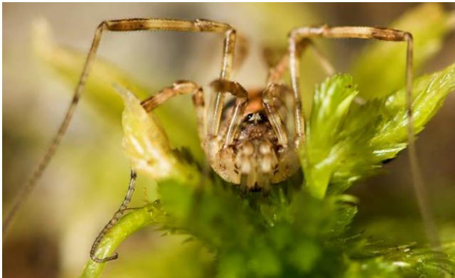
Figure 40. Paroligolophus agrestis on Sphagnum .