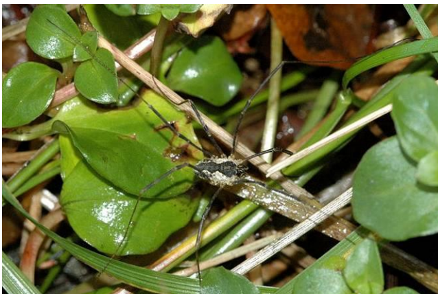
Figure 9. Dark color form of Mitopus morio .