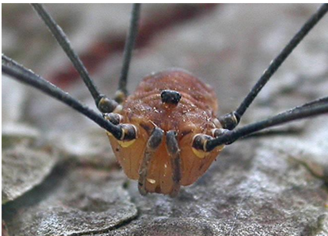
Figure 24. Close view of Leiobunum rotundum .

Often the harvestmen must walk a tightrope between moisture and dryness (Edgar 1971). Too little moisture causes the eggs to develop incompletely; too much encourages the growth of mold. While it would seem that bryophytes might be able to ameliorate the extremes of this moisture gradient compared to soil, documentation that