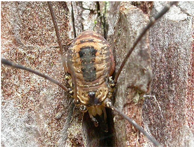
Figure 23. Close views of Leiobunum rotundum on bark.