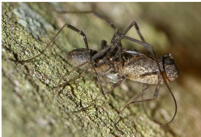
Figure 27. Oligolophus hansenii on bark.

Other species had much shorter active periods (Swain & Usher 2004). Forest-dwelling species like Oligolophus hansenii (Phalangidae; Figure 27-Figure 28) and Lophopilio palpinalis (Phalangidae; Figure 29) appeared for only a few weeks each year, with strong abundance peaks in early winter for O. hansenii and in late summer for L. palpinalis . Bog-dwelling species with year-long presence, like Rilaena triangularis (Figure 18), lack a strong abundance peak; in this species there was a very small spring peak. Nemastoma bimaculatum (Nemastomatidae; Figure 30-Figure 31), likewise a bog dweller, had a peak in autumn, and likewise exhibited low density throughout the year, as also demonstrated for Nemastoma lugubre by Vanhercke (Figure 32; Vanhercke 2004). These various phenologies combined to create the highest diversity in summer and autumn, when abundance likewise was at its highest. Winter diversity was the lowest, as one might expect.