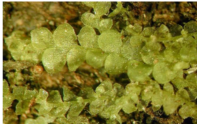
Figure 35. Lejeunea sp., member of a genus that is known to grow on the backs of harvestmen.

In Neosadocus variabilis , the females guard the eggs and young (Machado & Vital 2001). It is possible the same behavior occurs in N. maximus . The role of liverworts in nesting of N. maximus is unknown.