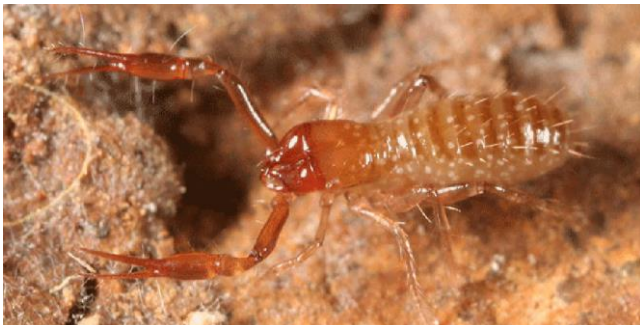
Figure 50. Apochthonius diabolus .

Apochthonius minimus (Chthoniidae; see Figure 50) is a small pseudoscorpion that inhabits bark, mosses, and leaf litter in the northwestern USA and British Columbia, Canada (Johnson & Wellington 1980). The Collembola that share its bryophyte habitat provide food. The larger Neobisium carcinoides appears to account for significant mortality of these springtails, most likely competing with the smaller Apochthonius minimus .