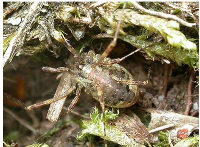
Figure 26. Paroligolophus agrestis (formerly Oligolophus agrestis ) among mosses.