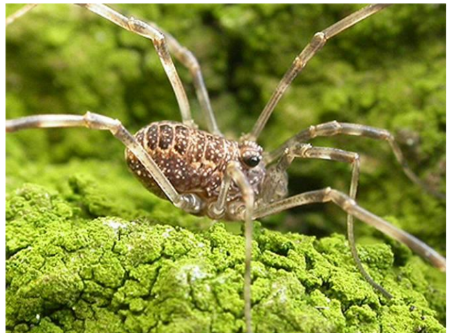
Figure 17. Rilaena triangularis resting on crustose lichens.