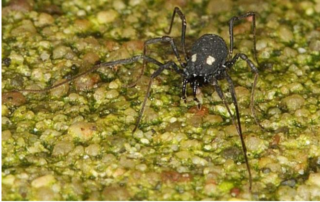
Figure 7. Nemastoma lugubre , a harvestman that can be found among mosses.