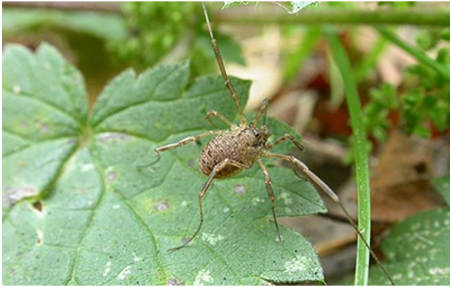
Figure 13. Oligolophus tridens , a harvestman that seems to prefer drier sites in boggy areas.