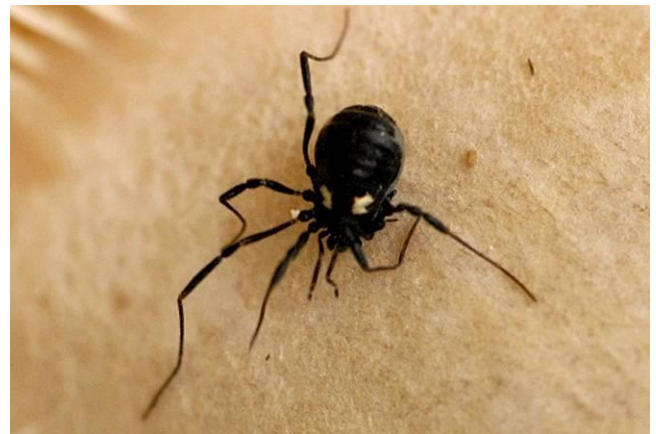
Figure 30. Nemastoma bimaculatum .