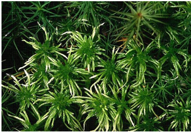
Figure 20. Sphagnum girgensohnii with Polytrichum commune at the upper edge, forming a harvestman habitat.

Sampling such as that of Biström and Pajunen (1989) are suitable for finding inhabitants within a moss mat, but one needs to be more clever to achieve representative sampling of those organisms that live on the surface. The harvestmen can move fairly rapidly, so those living in peatlands on the surface are unlikely ever to be sampled by removing cores. Differences in day/night habitat may also hinder sampling efforts, particularly for those that might migrate between shrubs/trees and the moss layer. Some harvestmen hang from the undersides of branches and leaves in the daytime, taking advantage of the shade to avoid overheating and desiccation, but become active at night. I have been constantly amazed at the number of species that are preferentially nocturnal in their activities, a concept that day-active humans like myself often fail to embrace. I am convinced that unless we develop and use a good sampling protocol for dusk and nightfall sampling we will not have a good understanding of those organisms that utilize the bryophyte habitat in their daily activities.