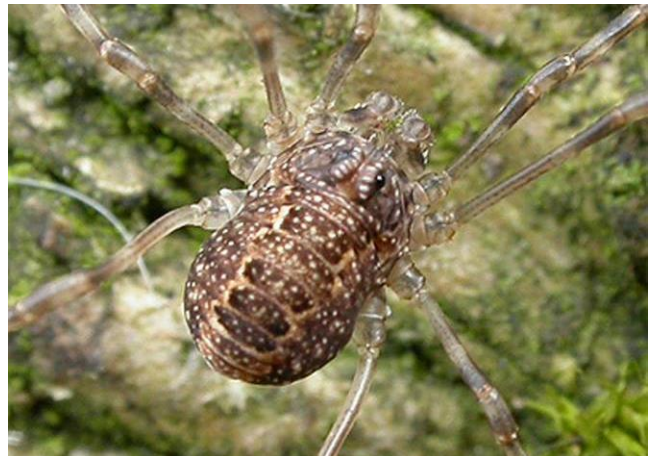
Figure 18. Rilaena triangularis resting on tree bark next to a patch of mosses.