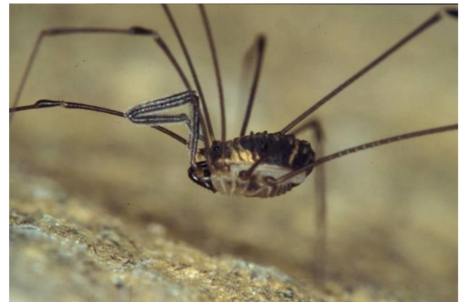
Figure 38. Mitostoma chrysomelas (Nemastomatidae).

Paroligolophus agrestis ( Phalangiidae ; Figure 39- Figure 41) is an ubiquitous European endemic and is the only member of its genus. It is listed as one of the species in the bog at Flanders Moss (Table 1). The legs are somewhat short for a harvestman and the body is only 3-5