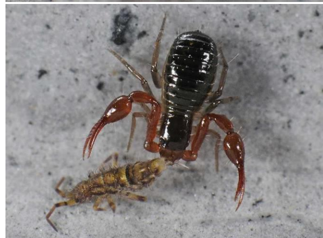
Figure 45. Pseudoscorpion Neobisium carcinoides feeding on the springtail Orchesella cincta .

In Finland forested and boggy sites, Biström and Pajunen (1989) reported Neobisium carcinoides among mosses at all five main sites. These sites were dominated by Sphagnum girgensohnii (Figure 20), S. squarrosum (Figure 46), and Polytrichum commune (Figure 19). This pseudoscorpion was a generalist, occurring with a density of 0.7 to 2.0 individuals per square meter. It seemed to have little preference for wet vs dry habitat.