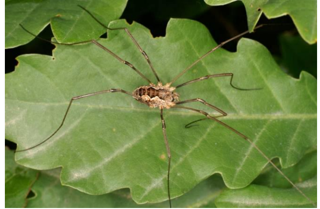
Figure 10. Two color forms of Mitopus morio .