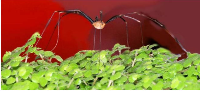
Figure 22. Leiobunum rotundum , a species that hides its eggs.

(Figure 21) not only hides its eggs, but deposits a "repugnant" substance on them (Edgar 1971; Clawson 1988; Macías-Ordóñez 1997).