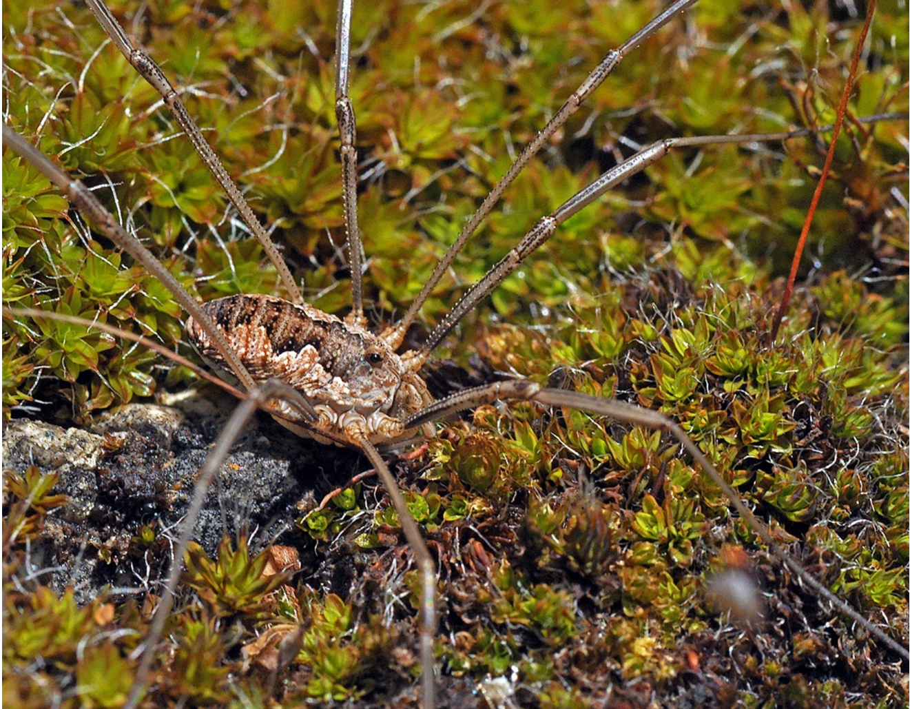
Figure 1. Phalangium opilio on the moss Tortula sp.