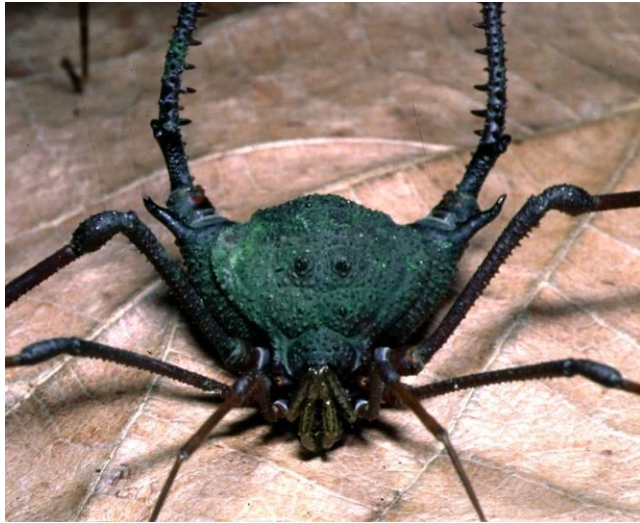
Figure 36. The harvestman Neosadocus maximus from Cardoso Island, São Paulo state, southeastern Brazil, with liverworts on its back.