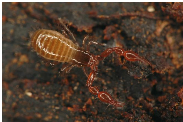
Figure 47. Microbisium brevifemuratum (Bog Chelifer), a pseudoscorpion that seems to be restricted to Sphagnum bogs and fens.