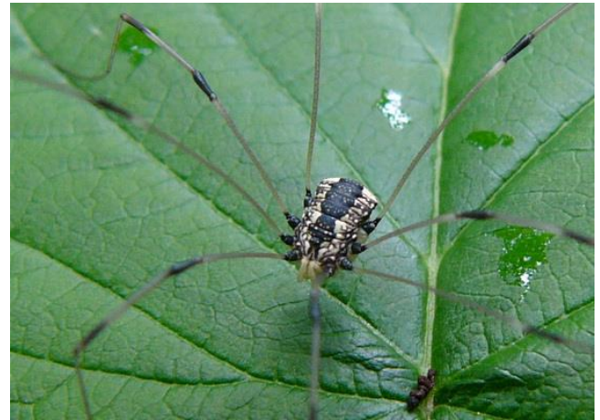
Figure 21. Leiobunum vittatum , a harvestman that uses mossy rocks for mating.

It appears that mosses play a role in the mating of at least some harvestmen, such as the striped harvestman Leiobunum vittatum (Figure 21). This species is common in the eastern United States. The males position themselves on moss-covered rocks, often remaining there for days at a time (Macías-Ordóñez 2000). One might suppose that being on a moss prevents desiccation during this prolonged visit. Following copulation, the female investigates potential sites for her eggs by injecting her ovipositor into cracks and crevices until she finds a suitable place to deposit the eggs (Machado & Macías-Ordóñez 2007). It would be interesting to investigate whether the state of hydration of the moss determines selection of location and timing.