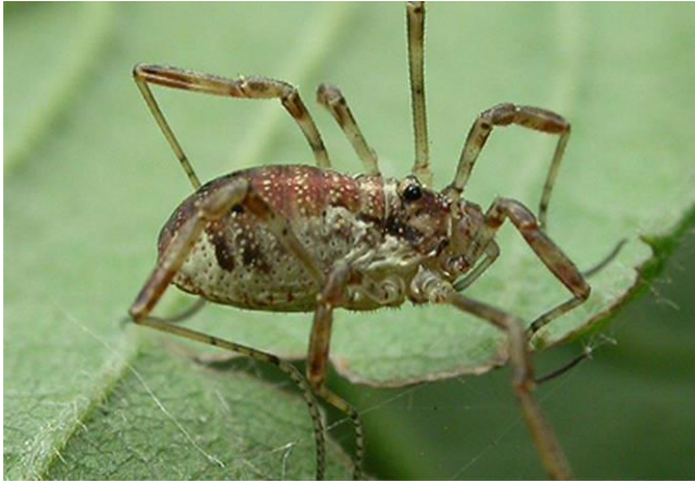
Figure 39. Paroligolophus agrestis (formerly Oligolophus agrestis ).

mm (TrekNatur 2007). The short legs could be an advantage in navigating mosses, particularly if it were to duck into the mat to avoid a predator or escape the sun.