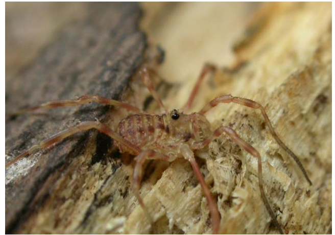
Figure 29. Lophopilio palpinalis on decaying wood.

the temperature and moisture fluctuations, so it is possible that these harvestmen may have longer activity periods than plant/tree-dwelling species, and possibly even longer than those living in litter or soil.