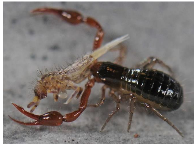
Figure 43. Pseudoscorpion Neobisium carcinoides feeding on the springtail Orchesella cincta .