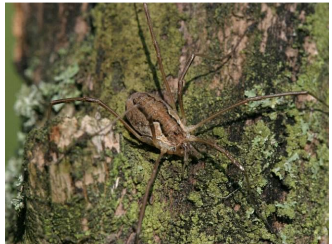
Figure 12. Mitopus morio with a background of lichens on bark.