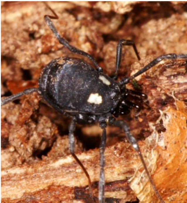
Figure 8. Nemastoma lugubre , a harvestman that lives among mosses as well as other substrata.