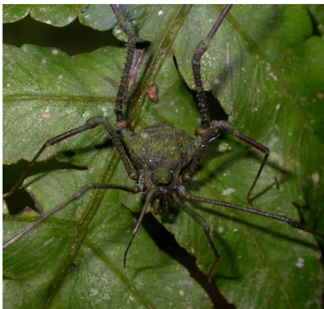
Figure 33. Neosadocus maximus from Intervales State Park, São Paulo state, southeastern Brazil, with liverworts on its back.

On quite another note, tropical liverworts (and Cyanobacteria) are known to grow epizootically on the backs of harvestmen (Machado & Vital 2001). On Cardoso Island in Southeastern Brazil, Aphanolejeunea subdiaphana (see Figure 34) and Lejeunea (Figure 35) aff. confusa joined the Cyanobacteria on the backs of at least four specimens of Neosadocus maximus (Figure 33 & Figure 36), but only two occurred out of 130 specimens in the coastal sand forest. On the other hand, out of only ten individuals in the rainforest, two had liverworts on their backs.