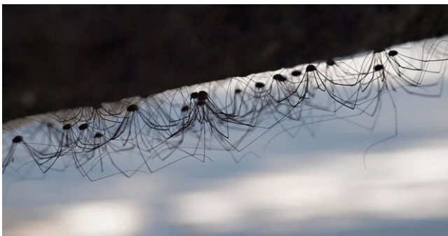
Figure 6. Aggregation of harvestmen.

Some species of harvestmen are known for their aggregation behavior (Figure 6; Coddington et al. 1990). When in these masses, they can sometimes resemble a moss until closer inspection is possible (Bugs in the News 2011). Aggregations of Leiohimum in southeastern USA have as many as a thousand individuals (Cockerill 1988). Wagner (1954) reported 70,000 individuals in aggregations of Leiohimum cactorum ( nomen nudum ). Mukherjee et al. (2010) reported up to 300,000 individuals of Pseudogagrella sp. (Sclerosomatidae) in a winter aggregation in a rainforest in China, although the individual patches had only 10-30 individuals.