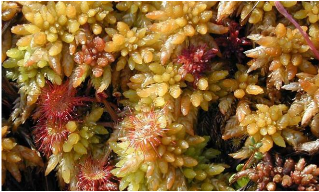
Figure 48. Sphagnum papillosum with sundews.

Graves and Graves (1969) likewise found specificity lacking among pseudoscorpions in their study. They seemed to have a wide niche ranging among fungi, mosses, Rhododendron leaf litter, and other microhabitats in a North Carolina, USA, highland forest floor.