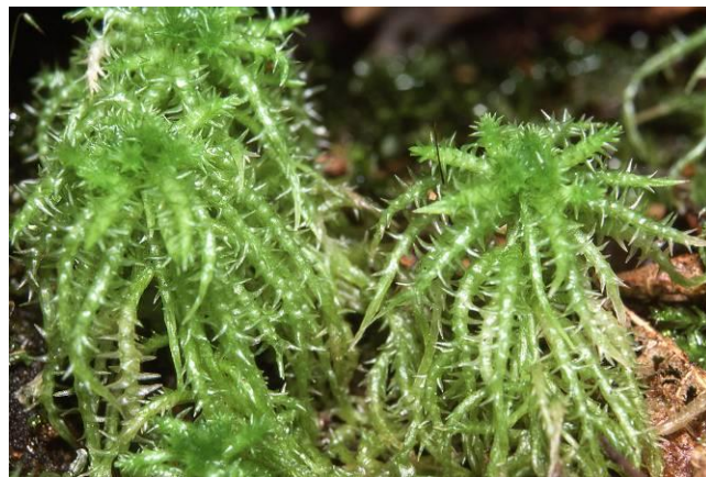
Figure 46. Sphagnum squarrosum .

In Finland forested and boggy sites, Biström and Pajunen (1989) reported Neobisium carcinoides among mosses at all five main sites. These sites were dominated by Sphagnum girgensohnii (Figure 20), S. squarrosum (Figure 46), and Polytrichum commune (Figure 19). This pseudoscorpion was a generalist, occurring with a density of 0.7 to 2.0 individuals per square meter. It seemed to have little preference for wet vs dry habitat.