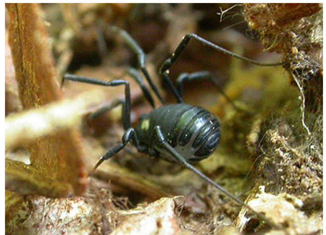
Figure 31. Nemastoma bimaculatum among mosses and litter.