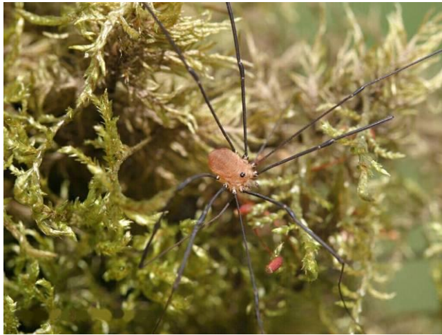
Figure 2. Leibunum rotundum male on mosses, demonstrating the slender black legs of this species.

proposition. On the other hand, these long legs permit them to move quickly across the surface without attracting undue attention. They are light weight, and their long legs act like a spring board, softening their impact as they run, another feature that is useful for running across loose vertical bryophyte structures.