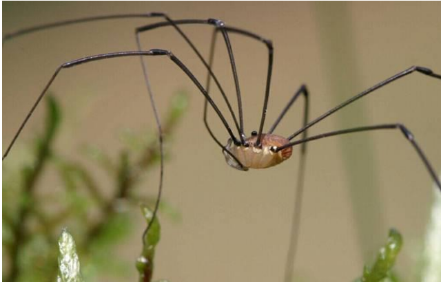
Figure 5. Leiohimum rotundum male on mosses, demonstrating the detachable legs of this species. This fellow seems to have sacrificed one of its eight legs already.

generally this leg cannot regenerate (Figure 5). If one watches this process, a surprise ensues. The detached leg continues to twitch! This can last from as little as a minute to as long as an hour, depending on the species (Opiliones Internet Discussion Group 2011). There are "pacemakers" in the ends of the femur of the leg that signal the muscles to extend the leg. The leg relaxes between signals, causing a repeated twitching motion. This could draw the attention of the predator away from the harvestman, allowing it to escape.