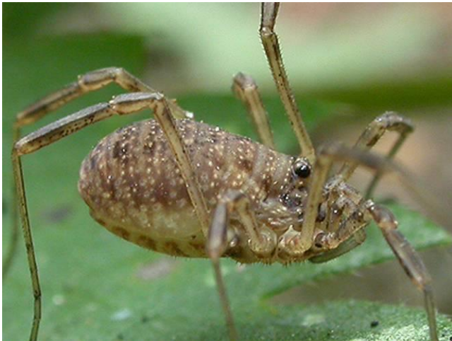
Figure 14. Oligolophus tridens , a harvestman that seems to prefer drier sites in boggy areas.