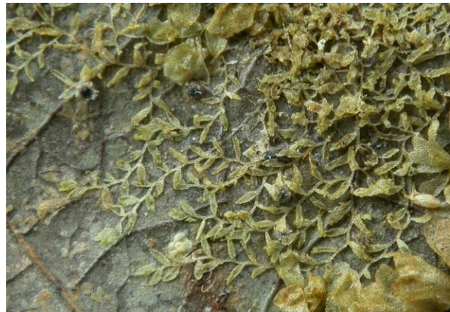
Figure 34. Aphanolejeunea truncatifolia from Uganda, showing the small size of this genus.

These liverworts seem especially adapted for such habitats. They have adhesive cells on their propagules (dispersal units, in this case gemmae ) that aid attachment and they colonize rapidly (Machado & Vital 2001). The harvestmen seem to accommodate the colonization by having depressions in the dorsal scutes, similar to those of the beetles that are colonized by bryophytes. Setae, pubescent areas, and tubercles may also help by retaining moisture (Gressitt et al. 1968; Gradstein et al. 1984). And, like the beetles, these harvestmen have a long life span (3-4 years) (Juberthie & Munoz-Cuevas 1971, Cokendolpher & Jones 1991, Gnaspini 1995) that may aid establishment (Gradstein & Equihua 1995). Both are slow-moving and widespread. The female harvestmen lay 26-64 eggs on vegetation and remain to tend the eggs, which mature rapidly (Machado & Vital 2001). Machado and Vital suggest that the reluctance shown by this species to exude its repugnant odor (Cokendolpher 1987, Machado & Vasconcelos 1998) may be an additional adaptation to invite bryophyte establishment.