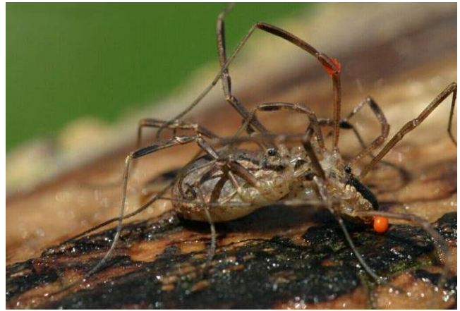
Figure 16. Lacinius ehippiatus mating. Note the red mite.

difference in arachnid species richness between Polytrichum commune (Figure 19) and S. girgensohnii (Figure 20). These differences may relate to moisture differences between the microhabitats since Sphagnum species are much better adapted to hold water than are those of Polytrichum .