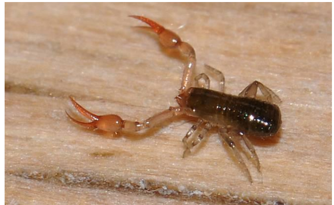
Figure 42. Neobisium carcinoides , known from mosses in boggy areas of Finland and also called moss scorpions.

Although pseudoscorpions are rare among bryophytes, some make the bryophytes home (Thydsen Meinertz 1962). Nevertheless, one of the most common of British pseudoscorpion species, Neobisium carcinoides (Neobisiidae; formerly N. muscorum ) (Figure 42-Figure 45), can occur among them (Kinchin 1992) and is known as a moss scorpion. This species is particularly interesting because it gets transported to new habitats by hitching a ride on flying insects! (Natural England). It should be happy among mosses because its diet is especially rich in mites and springtails, both fairly common moss inhabitants.