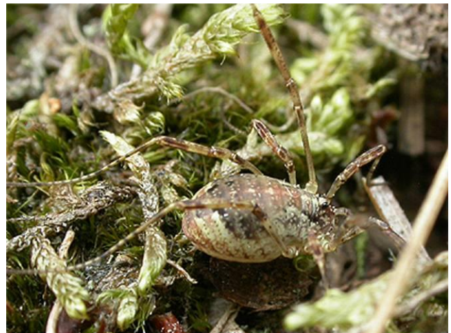
Figure 25. Paroligolophus agrestis (formerly Oligolophus agrestis ) among mosses.

The name harvestman refers to the many species that spend the winter as eggs, hence disappearing about the time harvest ends. Swain and Usher (2004) studied seasonal behavior of harvestmen as part of a restoration study at Flanders Moss, United Kingdom. The bog-dwelling Mitopus morio (Figure 11) has its peak abundance there in summer to early autumn, followed by Paroligolophus agrestis (Phalangidae; Figure 25-Figure 26) in late autumn to early winter. This results from the appearance of M. morio several weeks before, and its disappearance likewise several weeks before, P. agrestis .