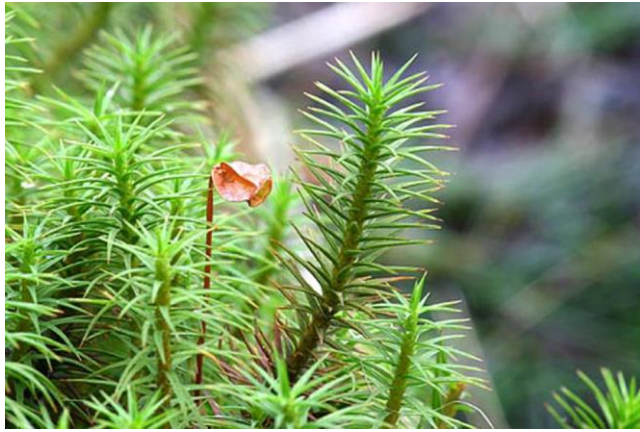
Figure 19. Polytrichum commune , showing its stiff leaves.