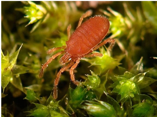
Figure 3. Siro sp. on mosses. Siro carpathicus is a species that lives among mosses. Note how short the legs are on this harvestman, compared to the more familiar garden species.

An adaptation for living within the bryophyte community might be to have short legs that would enable them to enter the bryophyte domain without getting their legs tangled or caught. In fact, being smaller in all ways could help. For example, Siro carpathicus (Sironidae; see Figure 3) is one of the few harvestmen known from within moss clumps and is among the smaller species of harvestmen (Rafalski 1956, 1958). But this species has the disadvantage that it is easy prey for the larger arthropods.