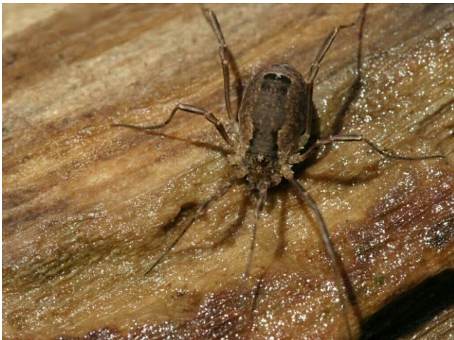
Figure 15. Lacinius ehippiatus female.

Biström and Pajunen (1989) found a slight indication that the fauna of Sphagnum girgensohnii (Figure 20) could be distinguished from that of the other moss stands, but this may be due to habitat differences that suited both the moss and the harvestmen rather than a preference for this Sphagnum species. At Borgå, there was a significant