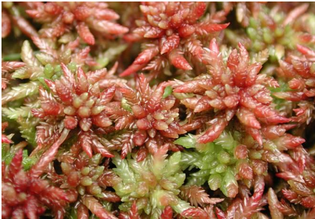
Figure 49. Sphagnum magellanicum , a species that typically develops red coloration in the sun.

Graves and Graves (1969) likewise found specificity lacking among pseudoscorpions in their study. They seemed to have a wide niche ranging among fungi, mosses, Rhododendron leaf litter, and other microhabitats in a North Carolina, USA, highland forest floor.