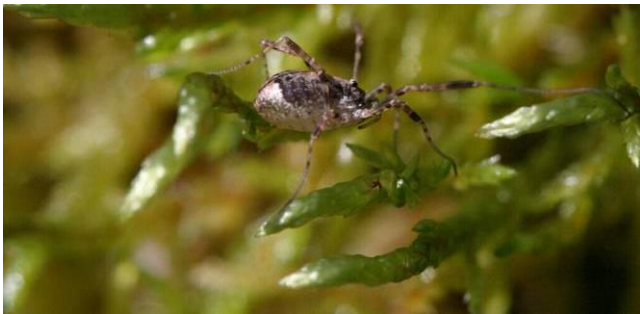
Figure 41. Female Paroligolophus agrestis on a moss, possibly Pleurozium schreberi .

Peatland harvestmen tend to be generalists (Swain & Usher 2004), occurring in a wide range of habitats. Swain and Usher suggest that the high exposure and rapid temperature fluctuations of mires creates a harsh environment that requires adaptations to a wide range of microclimatic conditions, thus explaining the preponderance of generalists.