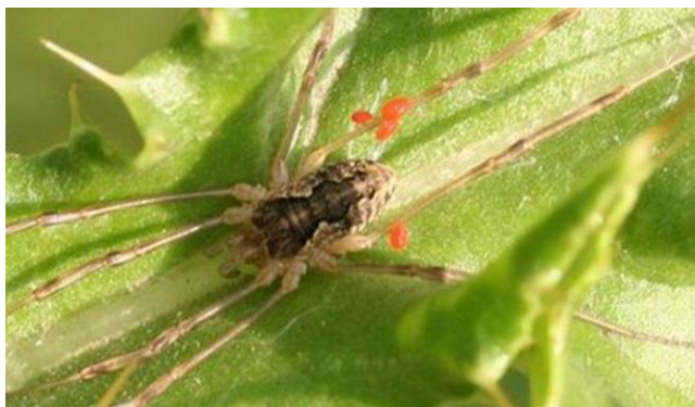
Figure 37. Harvestman with parasitic mites.

Harvestmen are often prey of parasitic mites, as seen in Figure 37 (Cokendolpher 1993).