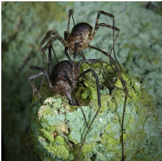
Figure 28. Oligolophus hansenii on lichens.

But these trends may not be indicative of harvestmen living among bryophytes elsewhere. Bryophytes can buffer