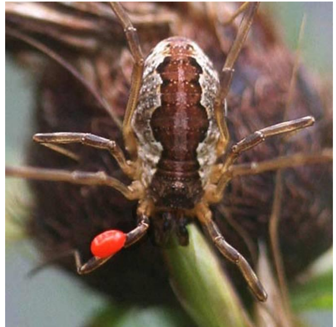
Figure 11. Close view of Mitopus morio with a red mite on its leg.