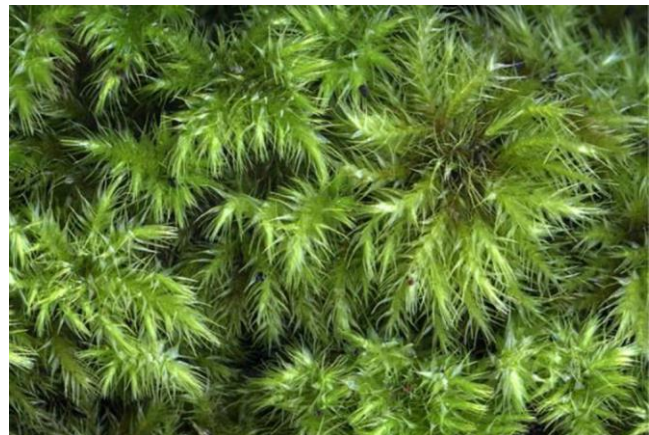
Figure 9. Mniodendron colensoi , Bill Malcolm, with permission.

Neil Bell (Bryonet 25 August 2010) reported that Mniodendron colensoi (= Hypnodendron colensoi ; Figure 9), a moss in the preserved patches of Kauri forest on the North Island of New Zealand, has prominent crystals in the costae of leaves. Bryologists have assumed these to be calcium oxalate, but verification is needed.