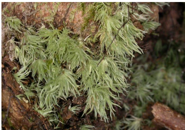
Figure 11. Leucobryum juniperoideum on log.