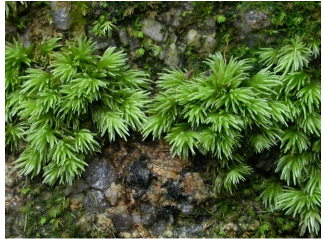
Figure 12. Leucobryum juniperoideum on a rocky substrate.