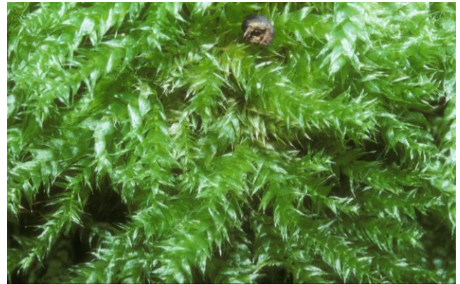
Figure 6. The competitive species Brachythecium rutabulum .

habitats, bryophytes can often again dominate due to lack of tracheophyte competition. To these stressful habitats, I would add the habitats with extremes of high mineral loading, very high or very low pH, or high temperatures. Polluted environments can present any or all of these conditions, as can geothermal fields (Figure 1).