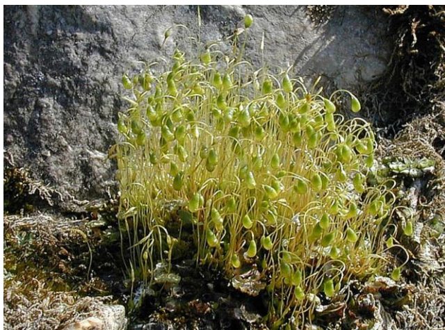
Figure 5. The short-lived ruderal species, Funaria hygrometrica , illustrating its high reproductive rate.

The relative growth rate (RGR) of a species is generally considered the best measure of the success of the species relative to other individuals or species in a given environment. Furness and Grime (1982) found that RGR for bryophyte species could be correlated with stress conditions in laboratory experiments. For the short-lived ruderal Funaria hygrometrica (Figure 5), RGR = \text{ca. } 50 \text{ mg g}^{-1} \text{ day}^{-1} , and for the competitive Brachythecium rutabulum (Figure 6), RGR = 70 \text{ mg g}^{-1} \text{ d}^{-1} . By contrast, stressed bryophytes such as epilithic (living on rock) species had much lower productivity ( RGR = 5\text{--}20 \text{ mg g}^{-1} \text{ d}^{-1} ). Since tracheophyte RGR ranges from 4 to 400 \text{mg g}^{-1} \text{ d}^{-1} (Poorter & Remkes 1990), it seems that bryophytes are on the low end of the scale, and if Furness and Grime are right in their conclusion that low RGR relates to stress tolerance, bryophytes in general should be particularly good at it.