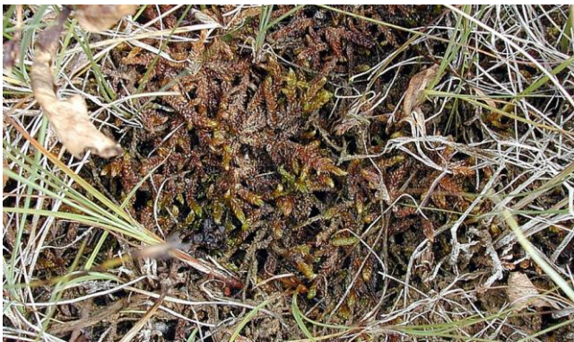
Figure 8. Scorpidium scorpioides growing in a fen.

One significant mechanism that permits plants to respond to stresses in a short period of time is by production of inducible proteins (proteins produced only when certain conditions are present) (Wray 1992), a genetically controlled phenomenon, but also potentially a result of past history. Such production is mitigated by inducible enzymes that respond to environmental cues such as toxic metals, salts, anaerobic conditions, temperature extremes, pathogens, and nutrient availability. Others respond secondarily to internal hormonal cues such as ABA (abscisic acid), ethylene, and GA (gibberellic acid). These hormonal mechanisms would appear to be available to the bryophytes, since all of these hormones are known in bryophytes. Inducible proteins are less well known among the bryophytes, but may some day prove to be important in their success. We are already gathering considerable information on stress proteins that respond to dehydrating conditions and high temperatures, as will be discussed when we examine water relations. Furthermore, Grime and coworkers (1990) contend that morphological plasticity is of reduced importance for bryophytes in exploiting disturbed habitats. Rather, their dispersal and regeneration abilities permit them to occupy inaccessible and disturbed habitats such as cliffs, walls, and forest clearings.