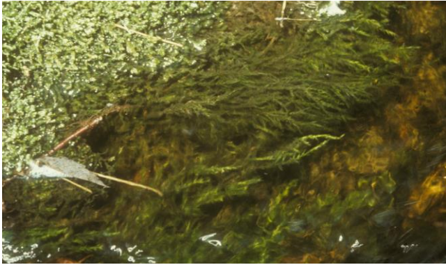
Figure 7. Fontinalis novae-angliae growing on rock at edge of stream.

populations grew best in water of the type from which they had been collected, suggesting that at least it is possible that osmotic relationships of the existing cells may have been affected by the change in water chemistry.