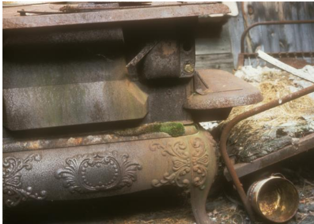
Figure 2. Old iron stove with bryophytes growing on it.

Bryophytes have unique physiologies that are often envied by the horticulturalists and agriculturists. Their ability as a group to survive cold and desiccation is unparalleled by any other major group of plants. It is these physiological abilities that permit them to occupy bizarre habitats like iron stoves (Figure 2) and darkened caves, geothermal vents and meltwaters (from snow and ice), and only a liverwort was able to survive on the first samples of moon rock.