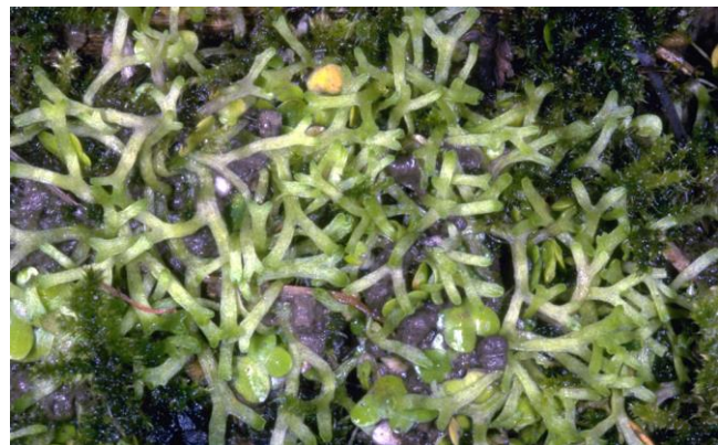
Figure 4. The floating liverwort Riccia fluitans stranded above water as it would be following a flood. It will form a broader thallus on land.

homogeneous life histories and habitats. Flood plain bryophytes can be considered here (Figure 4).