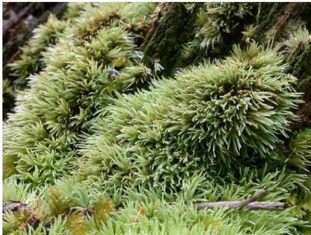
Figure 10. Leucobryum juniperoideum on soil.

Wang et al. (2014) addressed this question in the cushion moss Leucobryum juniperoideum (Figure 10–Figure 12). In eastern China, this moss occurs only in certain habitats. The epigeic (ground-dwelling) populations (Figure 10) occur only in areas that have a moso bamboo ( Phyllostachys edulis ) forest. The epixylous (on logs lacking bark) (Figure 11) are restricted to areas with Chinese fir ( Cunninghamia lanceolata ) forest. Epilithic (rock-dwelling) populations (Figure 12), on the other hand, live in both of these habitats. N and P concentrations differed markedly between the epigeic and epixylous habitats, with soil concentrations of these nutrients being much higher in the latter. So why is this species restricted to logs in the Cunninghamia forests? In experiments, growth of L. juniperoideum was reduced by N additions of 0.1 mol L -1 over six months. On the other hand, addition of up to 0.1 mol L -1 P caused growth increase. Furthermore, high concentrations of N (200 mg L -1 ) significantly reduce germination rates and delay early development from spores. P, on the other hand, has no such negative effects. Thus, high soil concentrations of N are limiting in the distribution of this species.