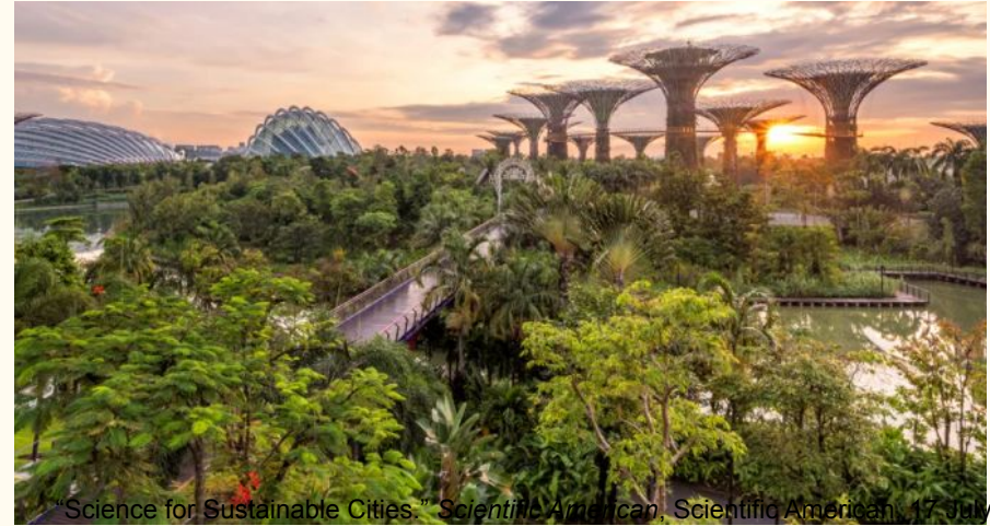
“Science for Sustainable Cities.” Scientific American , Scientific American , 17 July 2018, www.scientificamerican.com/report/science-for-sustainable-cities1/ .