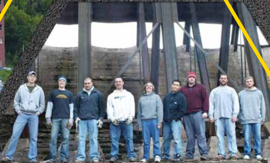
Redridge Dam Senior Design team