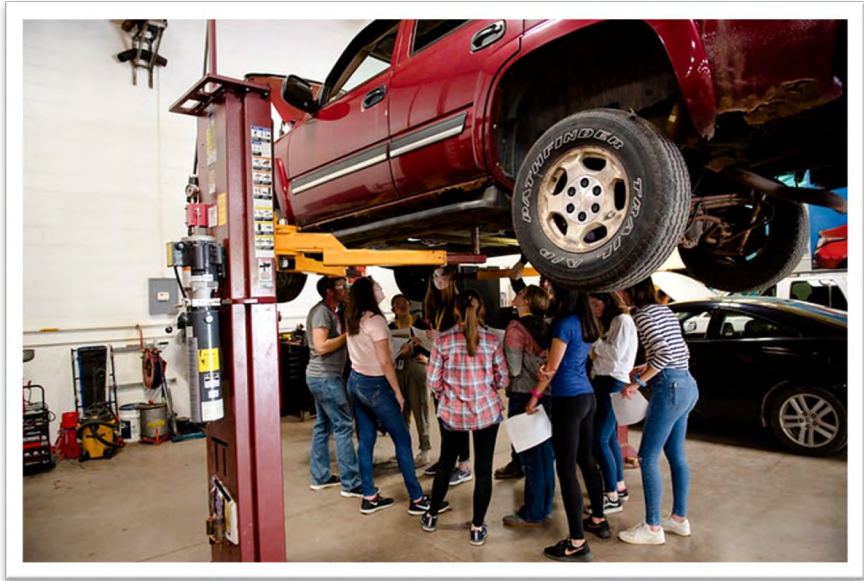
Students participating in the Women in Automotive Engineering (WIAE) summer youth program at Michigan Tech, sponsored by Dana Incorporated. This program allows these high-school students to explore the automotive industry as a future career.

This May, experts from MTU showcased some of the newest AV technologies — from connected car communications to infrastructure — and how they impact and improve fuel economy at one of the state's premier testing grounds, the American Center for Mobility (in Ypsilanti). Read in the PlanetM Mobility Report , mitechnews , and in Michigan Business Network .