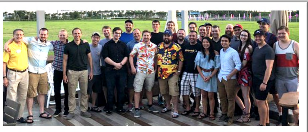
MTU Aerospace Enterprise personnel, past and present, gathered in Cape Canaveral on June 24, 2019 to celebrate the impending launch of the "Oculus-ASR" nanosatellite.