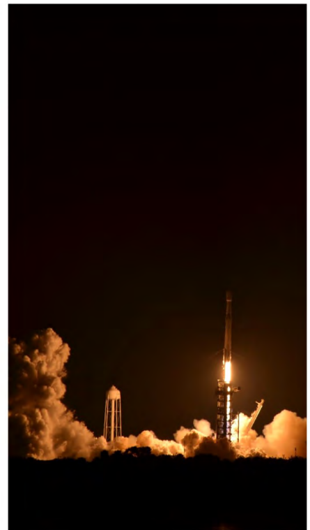
Lift-off of the SpaceX Falcon Heavy was at 2:30 am on June 25. Missed the launch or want to watch again? Follow the link to experience it all over again.