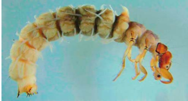
Figure 9. Hagenella clathrata larva, a species that lives in bogs.

Buczyńska et al. (2012) searched for the rare Hagenella clathrata (Phryganeidae; Figure 9-Figure 10) in Poland. This species is associated with bogs, making it even more threatened due to habitat destruction. This research team was able to collect larvae in the mountain area using Barber pitfall traps, indicating their mobility in terrestrial habitats.