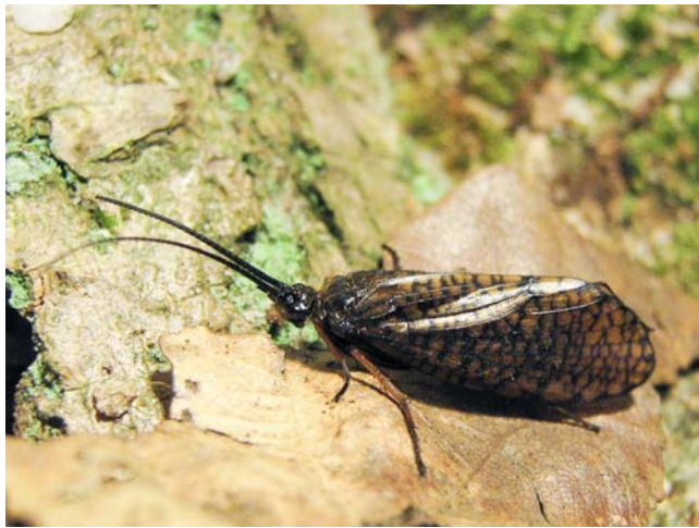
Figure 10. Hagenella clathrata adult, a bog dweller.