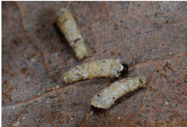
Figure 3. Enoicyla pusilla larvae, a species that inhabits mosses and leaf litter.

We now know that there are three species of terrestrial Enoicyla ( Limnephilidae ; Figure 1) in Europe, and that larvae of these live in the humid and temperate mosses of deciduous forests and rock crevices (Crampton 1920; Meidl & Molenda 2000), often far from water (Crampton 1920). Perhaps the best known of these terrestrial larvae are those of Enoicyla pusilla (Figure 3-Figure 5). These larvae build cases from fine grains of sand and vegetable matter among mosses (Butler 1886). In Britain, Enoicyla pusilla is restricted to woodlands, and Harding (1998) suggested that it may have been accidentally introduced from the European continent. This species has five larval instars, becoming more scarce by late summer. Eggs hatch in October and November, and larval success may depend on rainfall during those months. The larvae of this species typically occur among mosses and leaf litter.