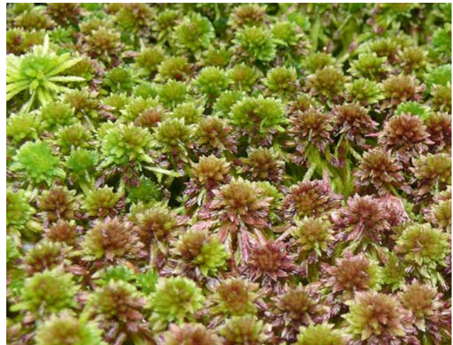
Figure 8. Sphagnum capillifolium ; Sphagnum is home for the larvae of Archithremma ulachensis .

Hayashi et al. (2008) cite the terrestrial habits of the limnephilid Nothopsyche . This genus has species in which both pre-pupae and pupae are entirely terrestrial. Their mitochondrial data indicate that this genus was originally aquatic and that just one lineage became terrestrial in the pre-pupal and pupal stages. In this terrestrial lineage, Nothopsyche montivaga became completely terrestrial. The terrestrial line also exhibit a switch in case materials from plant matter to sand.