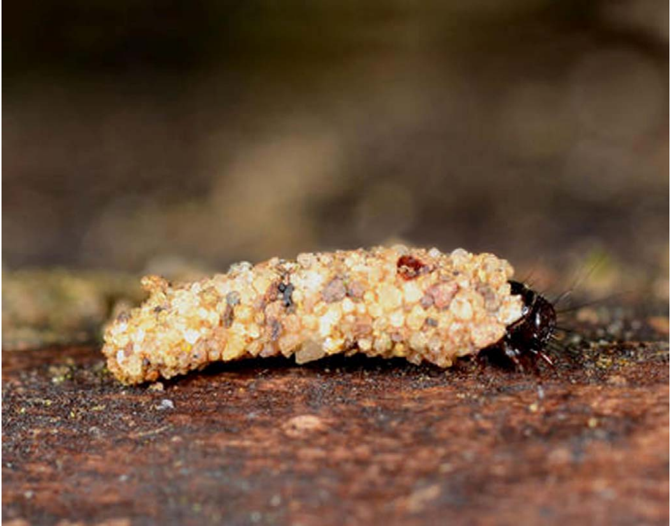
Figure 1. Eniocyba pusilla larva, the most common terrestrial caddisfly and often a moss dweller.

The adults of caddisflies are terrestrial, but most caddisflies have aquatic larvae. Nevertheless, a few have adapted to living in wet places on land. And mosses can provide those wet places. For example, Sleight (1913) described one member of Limnephilidae in mosses at tree roots, but not in the water.