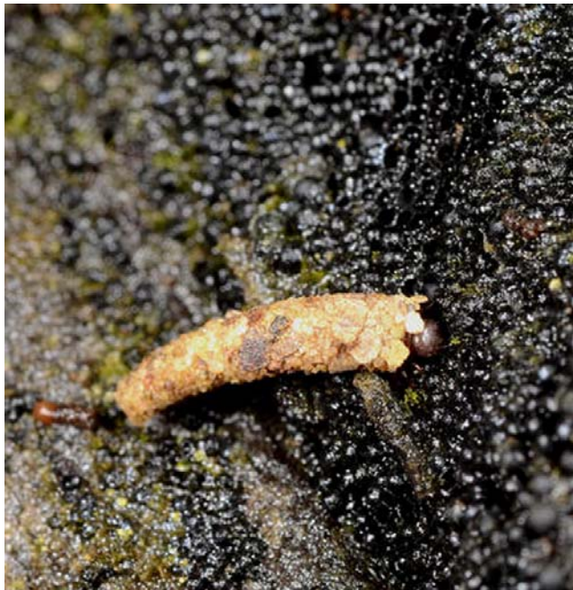
Figure 4. Enoicyla pusilla larva feeding on a slime mold.