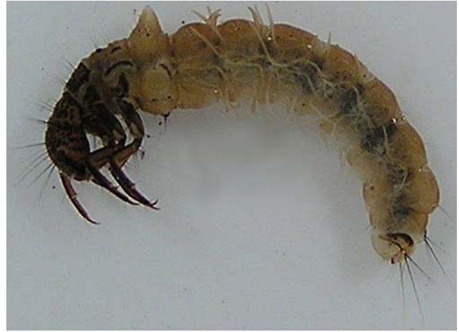
Figure 7. Limnephilus sp. larva; L. peltus burrows into mosses to pupate.

the family to clean the silk disks that close the case. The first abdominal segment lacks posterior rugosity, and there are no swimming legs. The larvae, however, live in water courses that have cold summer temperatures (3-5°C). The authors consider these cold brooks to have less food competition, thus favoring the larvae of this species.