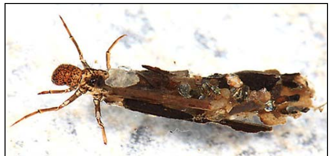
Figure 2. Pycnopsyche guttifera larva, a larva that eats terrestrial mosses when they become submersed.

Some aquatic larvae are able to feed near the surface of water. The aquatic Pycnopsyche guttifera (Figure 2) will sometimes eat terrestrial mosses, but this occurs when the mosses are just below the water line (Williams & Williams 1982).