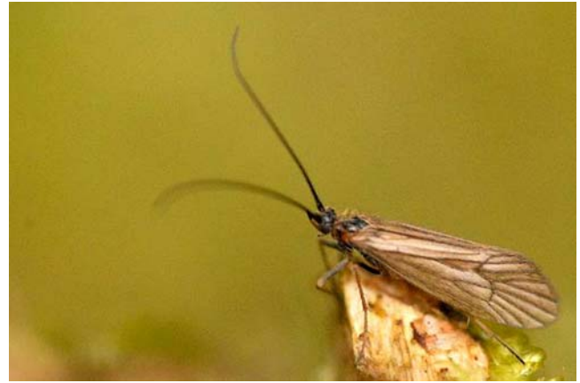
Figure 5. Enoicyla pusilla adult, a species whose larvae live among terrestrial mosses.

Green (1997) reported that in the UK the larvae of Enoicyla pusilla (Figure 3) feed on the soft tissues of dead leaves, mosses, and algae. In one observation, 50 or more individuals were actively climbing up logs and apparently browsing on black slime molds (Green 2012). Their requirement for nearly 100% humidity limits their terrestrial habitats. They have no gills and must rely on cutaneous respiration. If they get too wet, they climb upward and "hang themselves out to dry." When the humidity decreases to 70%, they drop again to the ground. Sometimes many larvae occur together on the surfaces of mosses and liverworts on stream banks after a rain (Green & Westwood 2005; Green 2012).