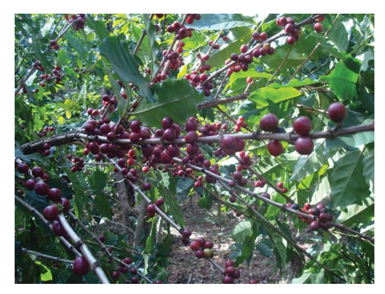
Figure 4.10. The bourbon variety in the coffee farms.