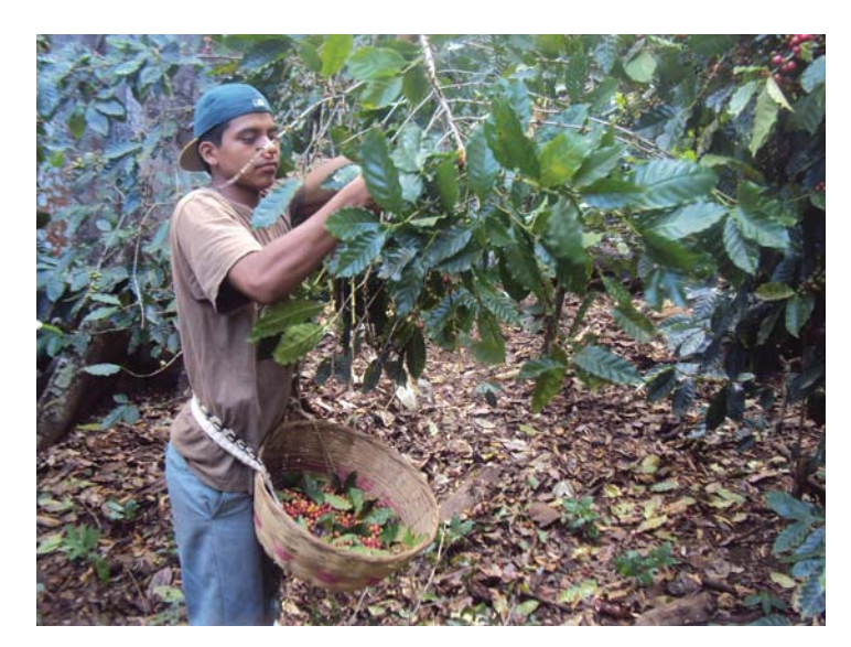
Figure 3.2. Community member harvesting coffee from one of the coffee trees.