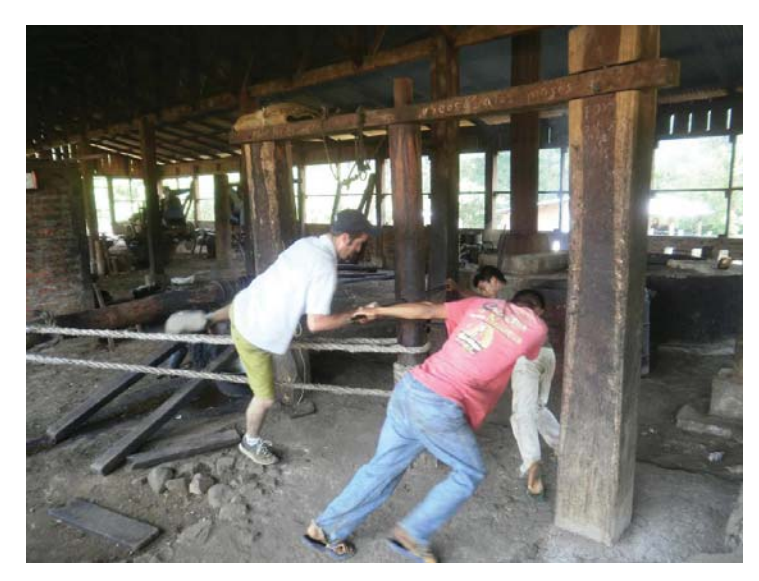
Figure 4.7. Twisting the sack of bark in the torcedera .