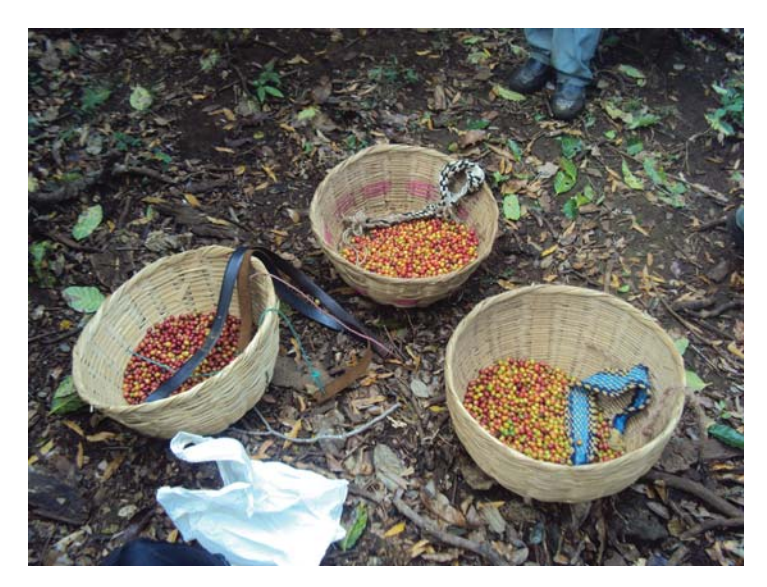
Figure 4.11. Canastas with coffee beans. One filled canasta is equal to 25 lbs.

At the end of the day, the coffee is taken to the hacienda and beans are separated. The ripened beans are weighed and given to the cooperative and the green beans can be kept by community members for personal consumption.