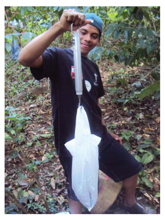
Figure 3.3. Weighing the harvested coffee.