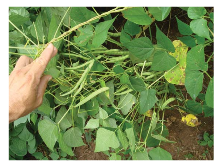
Figure 4.2. Bean crop.