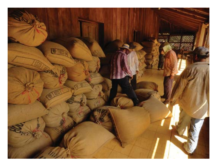
Figure 4.15. Coffee in sacks ready to be transported to exporter.