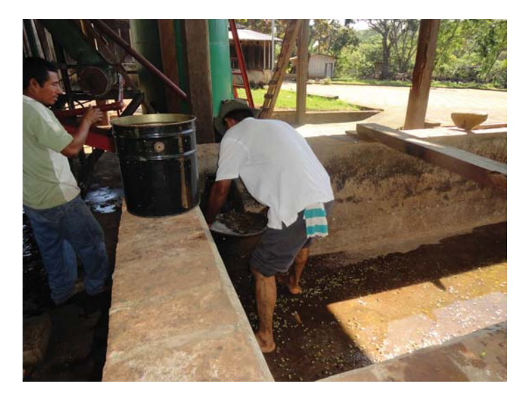
Figure 4.13. Coffee beans with parchment emptied into large concrete tank.

The remaining bean with parchment is laid out on a patio to dry for 8-10 days. During the drying process, the coffee is repeatedly turned over by community workers, this helps accelerate the drying process (Figure 4.14).