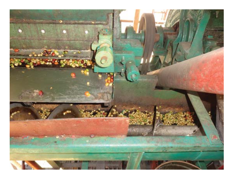
Figure 4.12. Separating coffee skin from the bean in the pulper.

After the ripened and green coffee beans are separated, the ripened beans are put into sacks and carried to the pulper. The ripened beans are poured into the pulper and the beans are separated from their epicarp (red skin) and mesocarp (pulp) (Wrigley 1988) (Figure 4.12). Water is pumped into the pulper by a gasoline motor. The water carries the epicarp and mesocarp through a channel to where it is emptied out onto the patio. The beans are carried by the water and emptied into a large concrete tank (Figure 4.13). The remaining beans with parchment are fed by water through a filter to separate the remaining pulp into a narrow concrete channel where they are cleaned of the remaining mucilage on the bean. After cleaning, the parchment is the only part remaining on the bean.