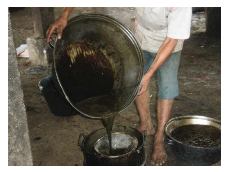
Figure 4.9. Separating the balsamo resin from water.