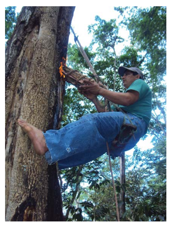
Figure 4.6. Farmer burning balsamo tree for resin extraction.

Once the burn is complete, the farmers will return after 20 days when the bark is madurado (ripe) and will stick a pañal (pieces of old fabric) to the burnt part where the resin leaches out. They leave the pañal for 25 days, or until the pañal is saturated with balsamo resin. The farmers scrape the pañal off with a cuto raspador (a thick flat metal tool similar to a flat head screwdriver). In addition, the farmers scrape the burnt bark and put both the pañal and bark in a bag and take it to the balsamera (area where balsamo resin is separated from the pañales and bark). Eight days later, the farmers return to the same balsamo tree to stick another pañal to the exposed layer where the bark was scraped off. The pañal is left for another 25 days, or until the pañal is saturated with balsamo resin. This too is taken back to the balsamera (Stratton undated).