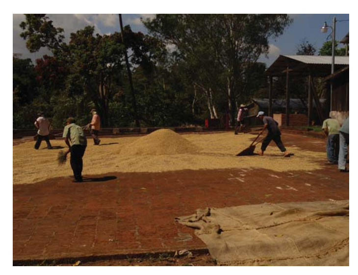
Figure 4.14. Coffee drying on the patio.