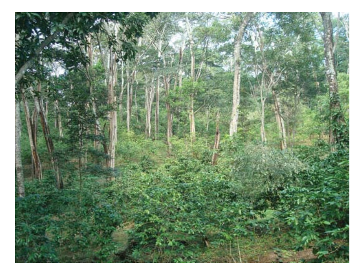
Figure 6.1. Coffee farm with balsamo tree as dominant overstory species.

Farmers in El Balsamar have long been planting coffee trees under a variety of cover types, the dominant cover type being balsamo (Figure 6.1 and 6.2). Farmers believe the shade provided from the balsamo tree decreases coffee yield and coffee is better suited under other shade cover types. These beliefs are consistent with several other studies. Shade effects on coffee yield are of higher importance than basal area in Chiapas, Mexico (Pinto et al. 2000). An additional study stated that an increase in shade tree density will decrease coffee yield (Nolasco 1985). According to the results of the study in El Balsamar, basal area affected coffee yield.