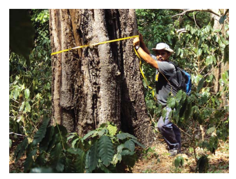
Figure 6.2. Large diameter balsamo tree.

The majority of farmers believe the balsamo tree retains much of the sun's heat, especially in the root system, as one farmer said, "the roots of the balsamo tree absorbs the heat from the sun and when planting coffee in close proximity to the tree, the heat kept in the roots reduces the production of coffee." Farmers say that balsamo is adapted to warmer climates and coffee is adapted to cooler climates.