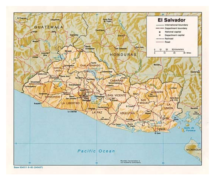
Figure 2.1. Map of Central America with El Salvador in the center (University of Texas 2012)

Out of all the countries in Central America, El Salvador is the smallest covering an area of 20,041 km<sup>2</sup>, an area that is slightly smaller than the state of Massachusetts (CIA 2012). The country borders Guatemala to the west and Honduras to the north. El Salvador is the only country in Central America without a Caribbean coast line (Figure 2.1) (CIA 2012).