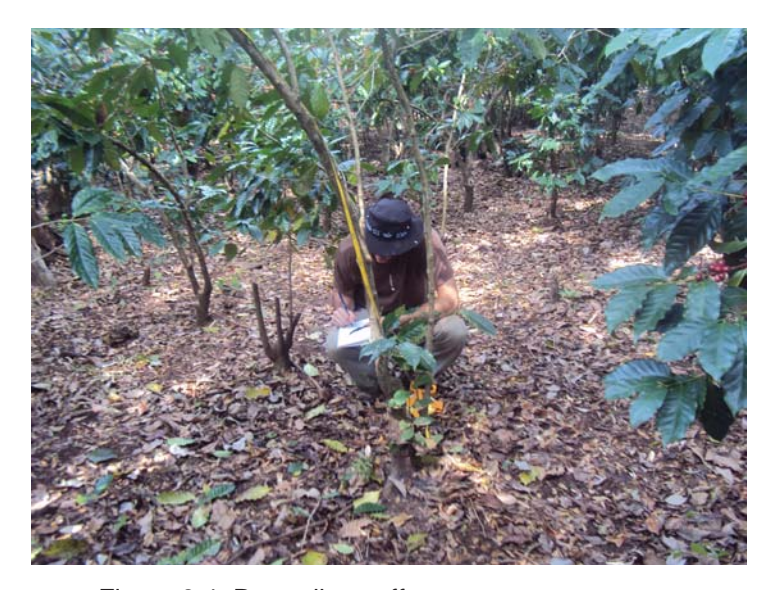
Figure 3.4. Recording coffee tree measurements.

While the coffee was harvested, coffee tree diameter was taken at 35 cm from the ground using a standard D-tape and tree height was also measured with a Kenson fiberglass measuring tape (Tiger Supplies Inc. 27 Selvage St, Irvington NJ 07111) (Figure 3.4). There were instances when the coffee tree's stem split into multiple stems below the 35 cm mark; if this happened diameter was found by taking the square root of the sum of all stem diameters squared (USDA Forest Service 2007). Light measurements were also recorded next to each of the 4 coffee trees per plot using an EXTECH Wide Range Light Meter (Extech Instruments, Townsend West, Nashua, NH 03063 USA) to measure the amount of sun light passing through the overstory. Within the same farms on all plots, light measurements were taken at the same time of day. However, light measurements taken between farms were not taken at consistent times of the day. Calibration of the light meter was calculated by taking readings in full sunlight beginning at 7 am until 5 pm at two hour intervals. These measurements were used to compare the differences between measurements taken in the farms and in full sunlight (Table 3.2).