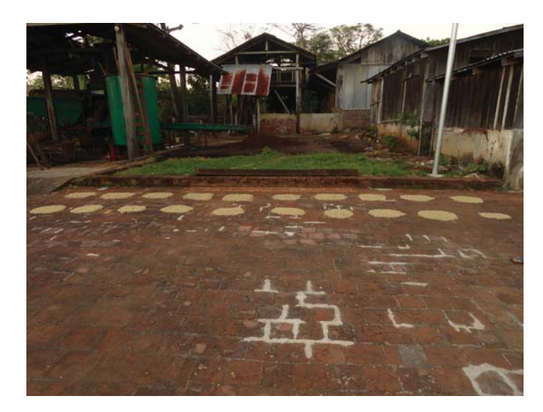
Figure 3.5. Coffee samples drying on patio.