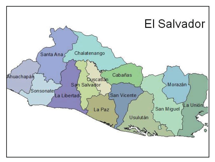
Figure 2.2. The administrative departments of El Salvador. Data Layers by Evan Anderson

The country is a republic made up of fourteen administrative departments: Ahuachapán, Sonsonate, Santa Ana, Chalatenango, La Libertad, San Salvador, Cuscatlán, San Vicente, La Paz, Morazán, Cabañas, Usulután, San Miguel, and La Union (Figure 2.2). The country's capital is San Salvador (State Department 2012).