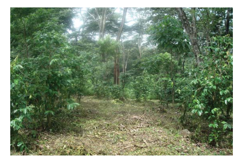
Figure 4.4. Coffee farm after the weeds have been cut.

The other primary source of work the cooperative provides to socios is balsamo tree resin extraction. Each socio is assigned their own balsamo tree plot to extract resin. Half the resin they extract and process is given to the cooperative while they keep the other half to sell in nearby towns. Nearby towns always pay the market price for balsamo resin. The market price for balsamo in 2010/2011 was between US$5.50 - US$6.00/lb. According to farmers, the market price for balsamo resin in 2010/2011 was more profitable than the 2009/2010 price of US$2.50-$2.75/lb.