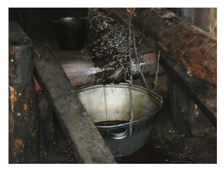
Figure 4.8. Balsamo resin from the bark shavings draining from a sack after being twisted in the torcedera .

The balsamo resin is leached out from the shavings with the water into a large iron bucket (Figure 4.8). The balsamo resin is then separated from the water (Figure 4.9) (Stratton undated). The shavings are dried and later become estoraque (dried bark shavings used as incense to repel insects).