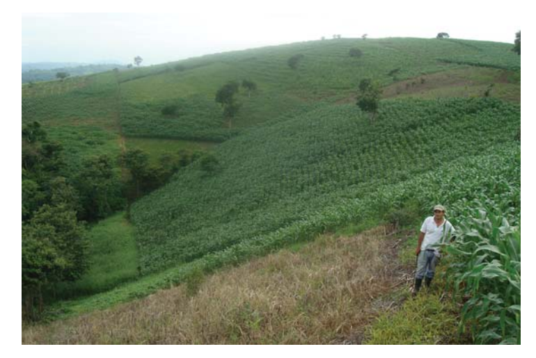
Figure 4.1. Farmer with maize and sorghum crops.