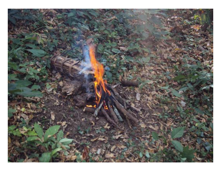
Figure 4.5. Hachon catching fire before used to burn balsamo tree.

Once the farmer is ready to burn, they tie themselves off by throwing the rope over a nearby branch or "v" slot and blow the hachon until it catches fire again. They place the tip of the flame against the bark until it starts to bubble (Figure 4.6). This does not harm the bark. If the farmers leaves the flame on the bark too long, the bark dries and no resin will leach out. Depending on the size and diameter of the tree, in a single day, a farmer can work between 10 and 23 balsamo trees.