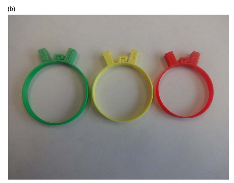
Fig. 1 (a) The OpenSCAD code (left) and solid model (right) of the 115 mm 3-D printable click-MUAC band<sup>(24)</sup>. (b) Colour-coded 3-D printed click-MUAC bands. From left to right the bands have an inner circumference of 135 mm (green; three dimples), 125 mm (yellow; two dimples) and 115 mm (red; one dimple). (3-D, three dimensional; MUAC, mid-upper arm circumference)

accurate with only an insignificant error of 0.287% between the average printed inner circumference and the solid model file when printed by a user-assembled RepRap. These are the most accessible and lowest-cost 3-D FFF-based printers in the world, which are capable of producing most of their own parts as well as a long list of appropriate technologies (28–30). In the failure analysis all bands tested passed a series of 500 deformations without any significant permanent deformation.