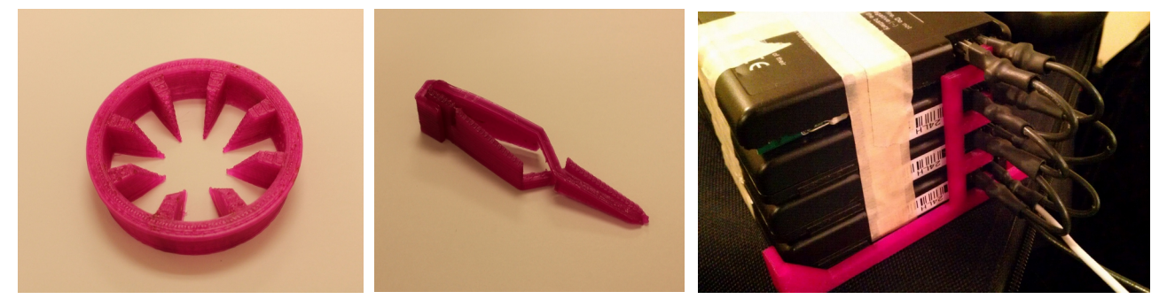
Figure 3. OSAT printed on the ultra-portable PV-powered open-source suitcase Foldarap 3-D printer a) avocado pit germination holder, b) cross tweezers and c) battery terminal separator.

designs and is growing exponentially [58], and were chosen from a selection of designs with the OSAT tag. It should be pointed out here that in general Thingiverse licenses would not offer any application problems in development. The one potential exception is creative commons non-commercial licenses, which could still be printed by community members although they could not be sold. The prints were chosen for varied print difficulty, times and volumes. The cross tweezers being one of the smaller end of expected print times, and the battery holder being a standard print. The cross tweezers require a fine enough resolution to test the accuracy of the printer. The following slicer settings were used for the experiments: 2 perimeters, 4 horizontal shells (2 top, 2 bottom), 35% infill, 1.7 mm PLA, and 200° C for the hotend and 55° C bed temperatures, respectively.